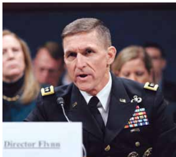
U.S. Army Lt. Gen. Michael Flynn, former director of the Defense Intelligence Agency.

We have come to a point, probably more dangerous than any time in my lifetime—and I'm counting the time, when as kids we used to have air raid drills, and we'd get under our school desks, and our teachers would tell us to cover our eyes, so we wouldn't be blinded by the blast, and cover the back of our necks, so something wouldn't hit us and break our necks. People understood nuclear war then, because we had dropped the atomic bombs on Japan, and they understood what it could do. Today, it's sort of vague, it's very distant.