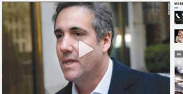
Michael Cohen, President Trump's attorney.