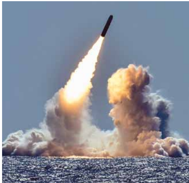
Trident missile launched from an Ohio-class ballistic missile submarine.

We've got Nikki Haley. She's supposed to be our top diplomat. You never hear her when she's not screaming hysterically for war. What kind of a diplomat is doing that? A dip-