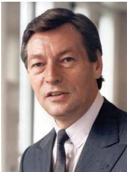
Alfred Herrhausen, assassinated Deutsche Bank chairman.

Herrhausen was assassinated on November 30, 1989, by the "Third Generation of the Red Army Fraction," whose existence has yet to be proven to this day. It happened only two days after Chancellor Helmut Kohl, who counted Herrhausen among his closest advisors,