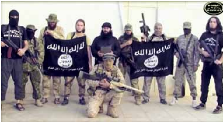
Terrorist video message from the militant Jihadist organization, Caucasus Emirate, 2015.

Dagestan, Ingushetia and North Ossetia, but also Tatarstan. Maintaining stability and enhancing prosperity in these areas are important for Russia, since Russia shares borders with the “stan” countries of Central Asia. All Muslim states that were for decades part of the Soviet Union, are now independent nations and are full members of the SCO, where Russia is a major force to reckon with.