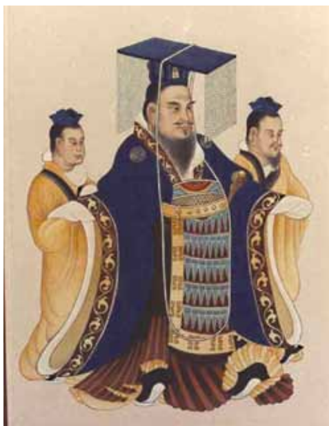
Emperor Wu of Han (ruled from 141-87 BC).

the same Sun who, in the final months of his life, urged his young protégé Chiang Kai-shek to study the Confucian classics.