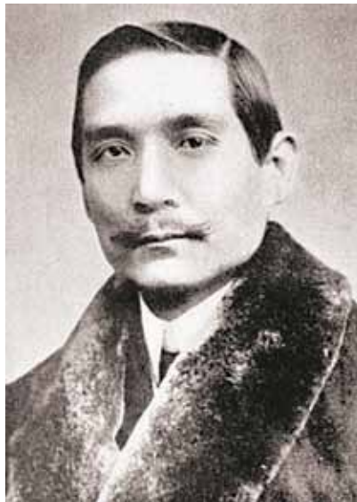
Dr. Sun Yat-sen, founding father of the Republic of China, in London in 1911.

Reaching far back into recorded history, and continuing into the 21st Century with modern China's increasing role in space exploration, great individuals from within Chinese culture have always looked to the stars to discover the true nature of Man's role in the galaxy. During the Song Dynasty (960-1279), one of the key scientific leaders was Shen Kuo (1031-1095), an astronomer, meteorologist, geologist, botanist, archaeologist, cartographer, hydraulic engineer, and mathematician. He was also a diplomat, finance minister, poet and musician. He served as the head of the Imperial Department of Astronomy in the Song court.