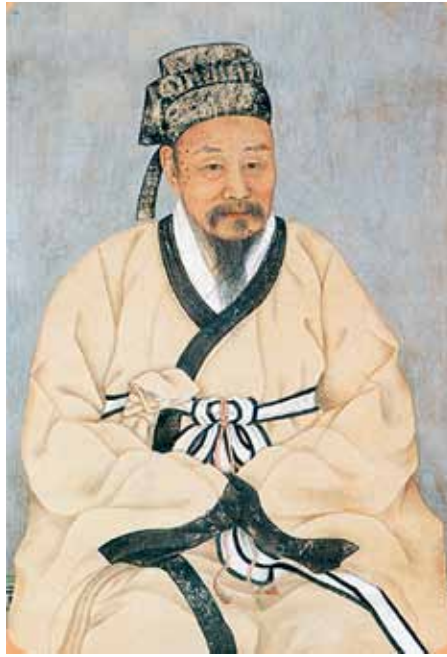
Zhu Xi, Confucian scholar in the Song Dynasty.

As stated above, by 1100 AD China was producing 127,000 tons of iron per year. Other industrial, hydraulic, power and related technologies were the most ad-