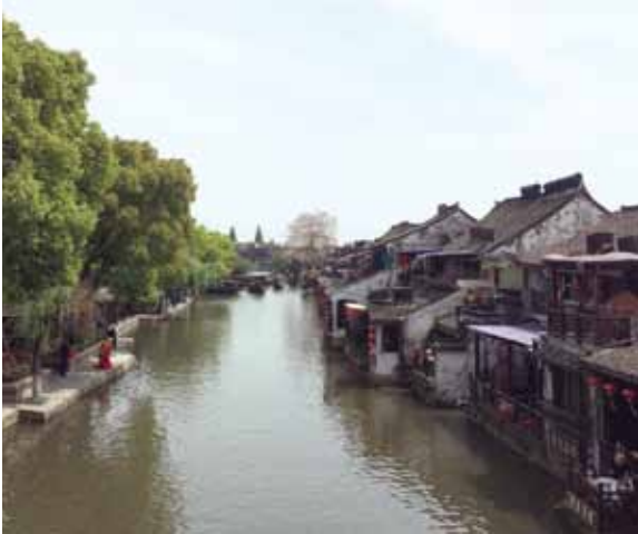
China's Beijing-Hangzhou (Grand) Canal, the longest and oldest canal in the world.