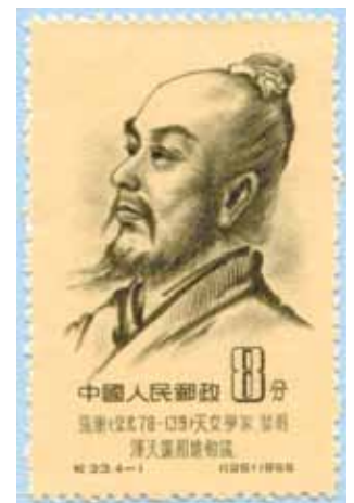
A 1955 Chinese postage stamp depicting Zhang Heng (78-139 AD), Han Dynasty scientist and statesman.

the world's first water-powered armillary sphere to assist astronomical observation; he invented the world's first seismoscope, which discerned the direction of an earthquake 500 km away; he postulated the idea of the