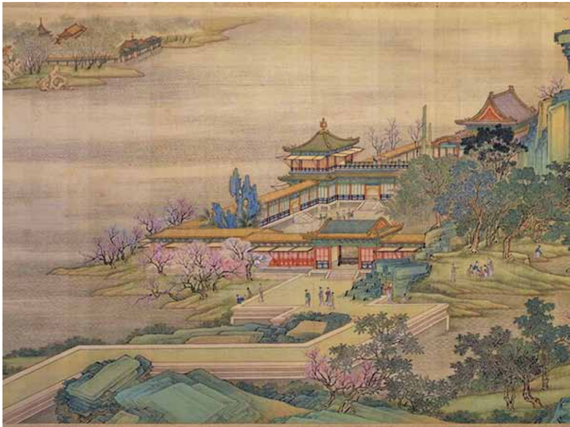
“Along the River During the Qingming Festival,” by Zhang Zeduan (12th Century).

The human mind—where our soul, our sense of identity resides—is always in a dialogue with itself.