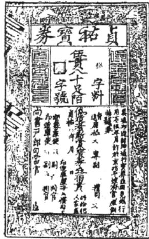
Copper plate for making paper money, from Jin Dynasty (AD 1115-1234).