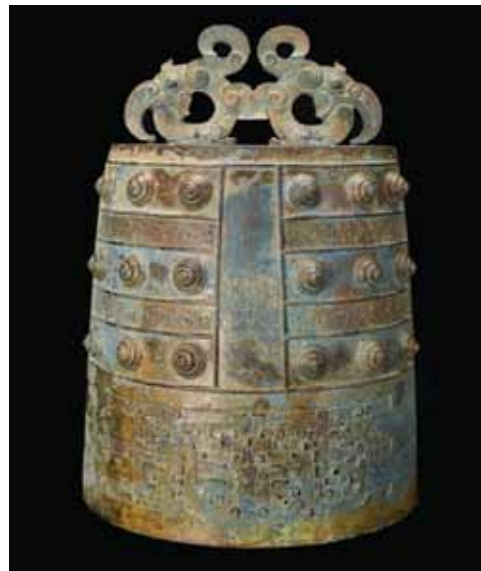
Ancient Chinese bronze bell, from c.500-450 BC, on exhibit at the Freer Gallery of Art, Washington, D.C.

we see a clear picture of how a lawful understanding of the human identity together with great progress in the physical sciences advanced hand-in-hand. And, again, we see the courage of key individuals in challenging themselves, examining the basis for their own beliefs, and testing hypotheses as to the principles which underlie creation.