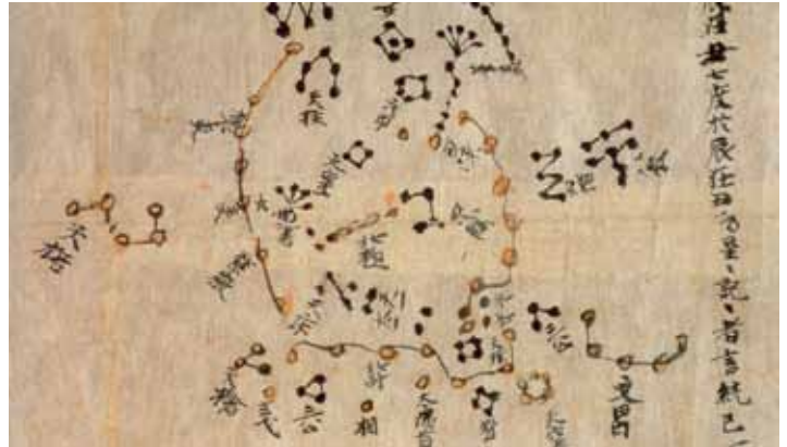
Star map of the celestial sphere, by Su Song (AD 1020-1101).