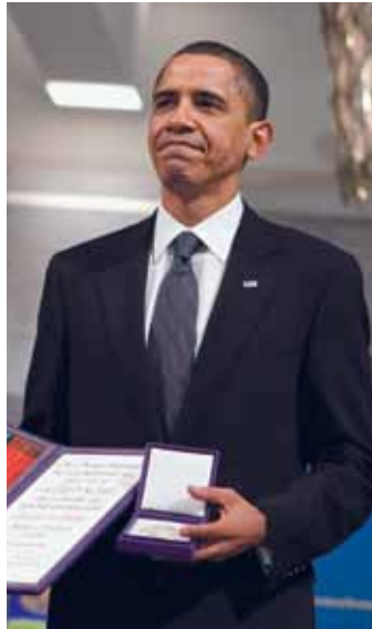
Killer Barack Obama receives the Nobel Peace Prize in 2009.

divert people from the true tasks at hand, as they vainly attempt to disrupt and delay the process of revolutionary change, so that their masters might have a chance (as they imagine) to put in place what is needed to slaughter their potential opponents.