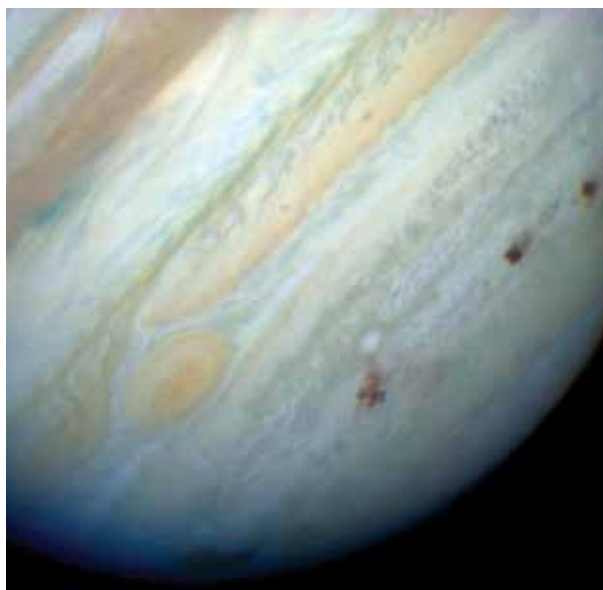
Brown spots mark impact sites of comet Shoemaker-Levy 9's fragments on Jupiter's southern hemisphere.

One recent example should suffice to illustrate the necessity for human scientific advancement. In 1994 the comet Shoemaker-Levy 9 struck Jupiter. Before its impact it broke up into fragments, the largest of which, fragment G, was estimated to have released an energy equivalent to 6,000,000 megatons of TNT (600 times the earth's nuclear arsenal) upon impact, creating a crater almost exactly the diameter of the Earth. If, instead of Jupiter, Shoemaker-Levy 9 had hit