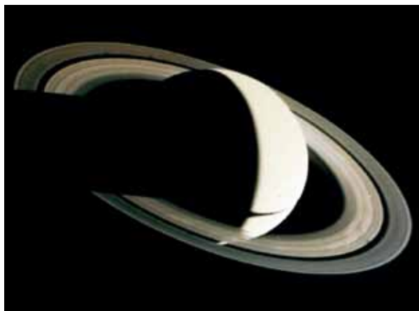
NASA Voyager 1 image of Saturn from 5.3 million km, showing Saturn's shadow on the rings.

With his discovery of the principle of Potential Relative Population Density , Lyndon LaRouche has defined a measurement to judge the worth or worthlessness of any given human culture, much as Yahweh judged Sodom. LaRouche's concept is not a formula, nor a mathematical measurement. It defines a process, a dynamic, and the rate of change in that process defines the ability of any given society to survive and perpetuate. As LaRouche correctly insists, for the human race to continue to exist as a potentially immortal species, there must be an ongoing anti-entropic increase in the