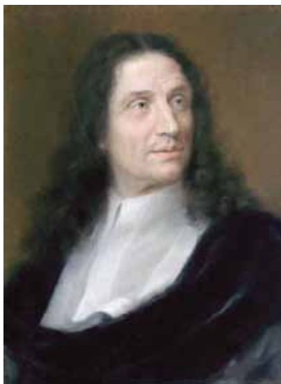
Domenico Tempesti Vincenzo Viviani (1622-1703)