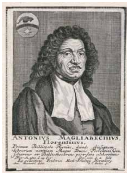
Antonio Magliabecchi (1633-1714)

Aside from Bodenhause, Leibniz's key collaborator in Florence was Antonio Magliabecchi, the head of Cosimo's library. While Magliabecchi didn't penetrate Leibniz's scientific work as deeply as Bodenhause, he was a passionate man of letters, who had a remarkable relationship with the wealth of Renaissance culture. (He had a collection of 50,000 books and manuscripts. It was said that he had studied most or all of them, and that he could recite innumerable passages and quote the page of the book.) He had no trouble recognizing the breadth and power of Leibniz's mind, and he would play an ongoing role in radiating Leibniz's works throughout Italy.