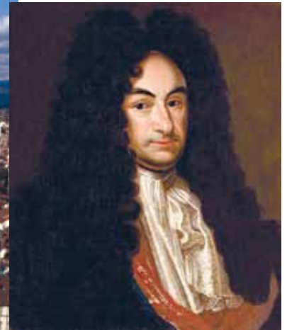
Gottfried Wilhelm Leibniz (1646-1716)

tionally blunted response may acknowledge some abstract moral duty to wipe out poverty, but the excitement and joyful anticipation of such a mission is strangely absent. However, it is a beautiful mission. We may actually have to get happy about the work ahead.