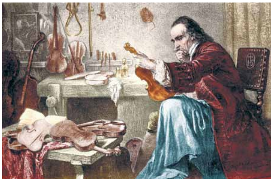
Antonio Stradivari (1644-1737)

Meanwhile, back in Cremona, Stradivari worked on his new instruments. Stradivari had actually received the commission for the Medici instruments in 1684; 12 however, while he completed other commissions within months, he appears to have only crafted his first three new "long Strads" six years later, in the spring and