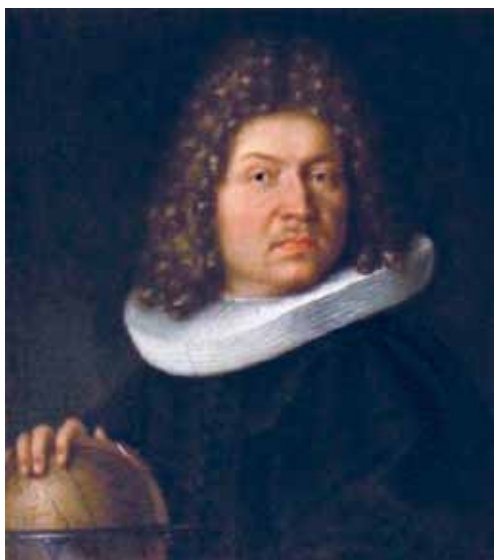
Jacob Bernoulli (1645-1705)

Huyghens had immediately sent in an answer, which was published in the next issue of the Acta along with a more extensive treatment of isochrone by Leibniz. It was Bernoulli's study of that material that prompted his May, 1690 article, at the end of which, Bernoulli posed his catenary challenge. Bernoulli had worked through Leibniz's new methods, including his calculus, and had followed Leibniz's attempts to educate Huyghens on Leibniz's more powerful generalized methods, which had been based upon Huyghens' prior work, and now he wanted to join the dialogue as an active partici-