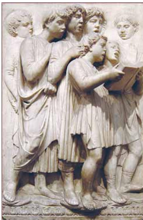
Luca della Robbia’s Cantoria, sculpted for the organ loft of the Cathedral of Florence.

Once attention is drawn to Raphael’s Florence of around 1500, it becomes rather unmistakable that the development of the violin was by design. Particular attention should be paid to the three years that Raphael and Leonardo da Vinci were both in Florence, 1504-06. Leonardo was no stranger to the design of instruments. The idea must have been based upon an attempt to unpack the workings of the amazingly full, powerful and beautiful sound of what we will designate as “bel canto” singing. 4 Beautiful evidence of such exists in Luca della Robbia’s 1430s sculpture for the Cathedral of Florence, in which he captured the mouth positions