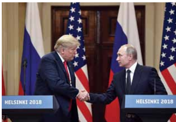
President Trump (left) and President Putin at press conference following their historic summit in Helsinki, Finland, July 16, 2018.

is critical, where the actions of individual human beings shall determine which path is taken. This is where the concept "acting on the future" becomes concrete: Shall each of us find new powers within ourselves to intervene now to aid in bringing the New Paradigm into existence? This is an individual personal responsibility.