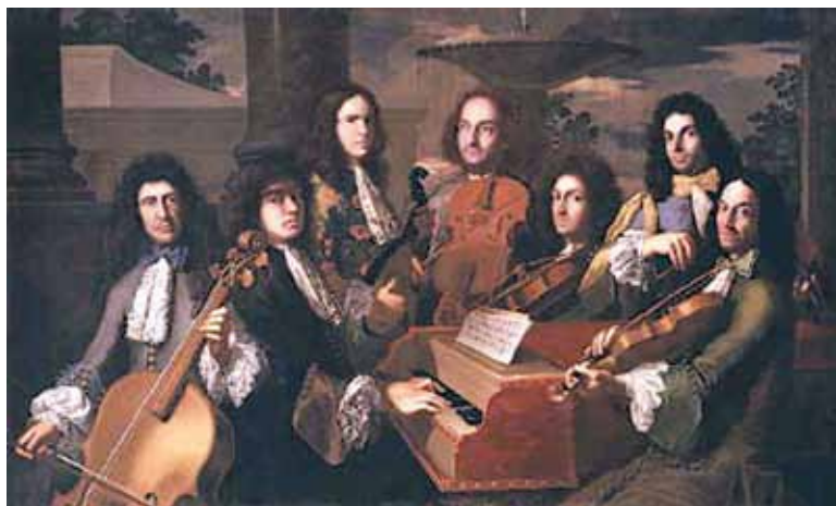
Painting by Antonio Domenico Gabbiani. 1685.

Florence’s Duke Cosimo III de Medici employed Baron Bodenhause to tutor his two sons, Grand Prince Ferdinando, then twenty-five, and his brother, Prince Gian Gastone, eighteen. Ferdinando was already quite passionate about music and was a patron of the arts. The year before, in 1688, Ferdinando had brought to Florence, Bartolomeo da Cristofori—the future inventor of the pianoforte. Cristofori was given a significant salary, with the assignment of restoring the ancient instruments in the collection of the Medici and of developing