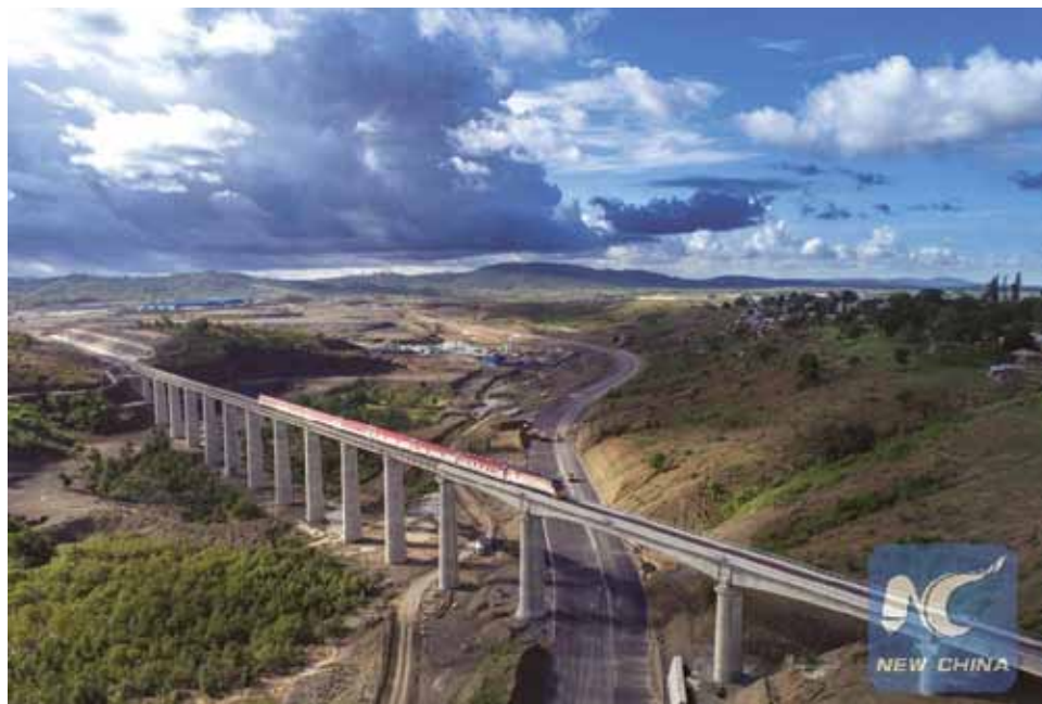
Mazeras Bridge of the Mombasa-Nairobi Standard Gauge Railway in Kenya.

As we elaborate in the Land-Bridge report, the Chinese model of economy and the American System of economy are actually much, much closer than most