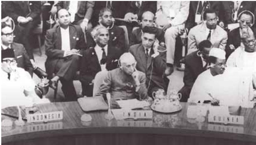
Delegates at the Asian-African Conference in Bandung, Indonesia, April 1955.

So, instead of adopting our plan, which was under consideration already then, they instead went for “shock therapy” and, from 1991-1994, dismantled the industrial capacities of Russia to only 30% of what it had been. What followed was the decade of the Yeltsin genocide, in which the Russian population was decimated by 1 million per year, due to that economic shock therapy.