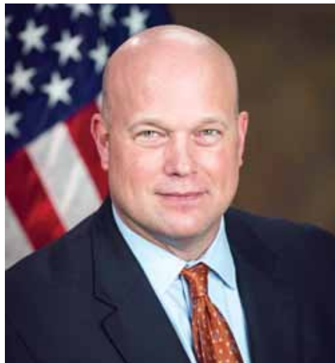
U.S. Dept. of Justice Matthew Whitaker, acting U.S. Attorney General.

In his post-election press conference on Nov. 7, Trump signalled that he is hoping for a bipartisan collaboration with Nancy Pelosi and the Democrats to work on legislation, thus putting the Democratic Party into a situation where either they start to take care of the “forgotten men and women” in the tradition of Franklin D. Roosevelt, or, if they continue with their identity politics, going for the impeachment—which as I just said, is now almost impossible—that could very well lead to a split in the Democratic Party.