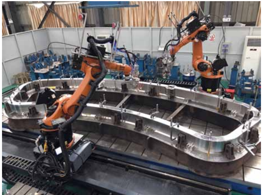
ITER Thirty-five nations are collaborating to build and operate the ITER Tokamak, the world's largest fusion experiment. Here, a high-power laser welding system developed in China is used to seal the structural case of one of many ITER correction coils.

We have said many times that you can easily retool all of these military industries to produce useful things. If the United States would move to retool its military industries to build fast train systems, new infrastructure, go into a crash program for thermonuclear fusion, and cooperate with other nations in space research and travel, we could actually use all of these things and everyone could even remain wealthy; nobody is proposing to take the profit away from people who are now stuck in military production. But we could really move all of these productive capacities into a useful situation: The United States urgently needs infrastructure. The United States urgently needs a fast train system connecting all its major cities, and naturally also the subways and the roads, electricity production and distribution, communications—there's so much to do.