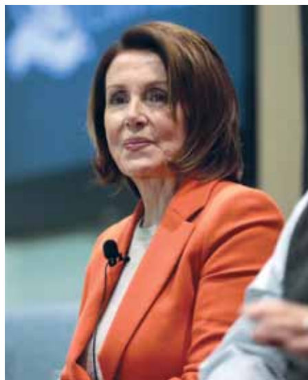
Rep. Nancy Pelosi.