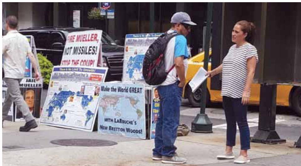
LaRouche PAC street organizing in New York City, Oct. 2, 2018.

Helga Zepp-LaRouche: I don't think it's a victory for the Democrats at all. It is quite usual that in the midterm elections, the sitting President gets sort of one black eye, because people are always discontented about something. That happened, by the way, to Obama