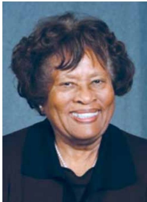
Dr. Joycelyn Elders, former United States Surgeon General.