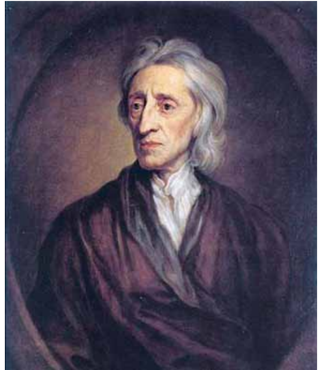
John Locke, in a portrait by Godfrey Kneller.

have never regained fully what Truman ruined, to the present day.