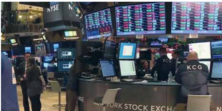
The New York Stock Exchange, one scene of the casino economy.

For example, the European Union has suspended the rules of the stability pact, Trump has invoked the National Defense Act. There are many measures being taken. Various "bazookas" have been taken out, giving credit to firms to delay tax payments, even talking about directly handing out money to everybody who needs it. All of these things are necessary steps to just keep the economy going, and necessary to calm down the popu-