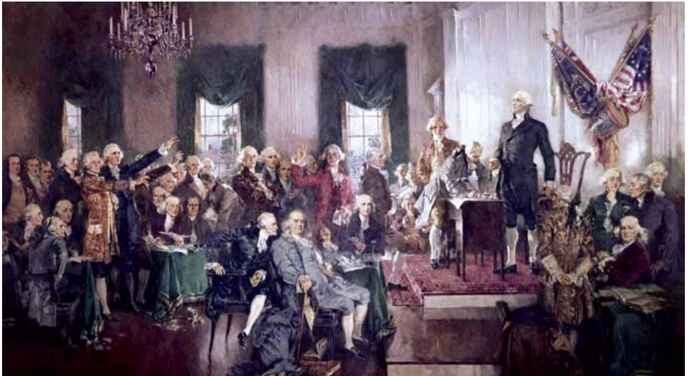
Scene at the Signing of the Constitutional Convention, painted by Howard Chandler Christy (1940).

Liberalism of Sarpi's principal followers was, in one sense, the removal of the obstacle to progress represented by the modern Aristotelean legacy; but, while Sarpi licensed some practical innovations which the Aristoteleans abhorred, Sarpi was vicious in his determination to prevent innovation from leading to the recognition of actual universal principles, of physical science, or otherwise.