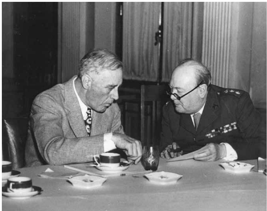
President Franklin D. Roosevelt and Prime Minister Winston Churchill at Yalta, Feb. 4, 1945. Their wartime partnership was an alliance of two adversaries-in-principle, thrust together for an urgent common course of the moment. Churchill was devoted to empire; Roosevelt to the eradication of all empires.

Essentially, since that 1620-1689 interval, the essential difference between the political philosophies of Europe's parliamentary traditions and the United States, has been typified by the leading American patri-