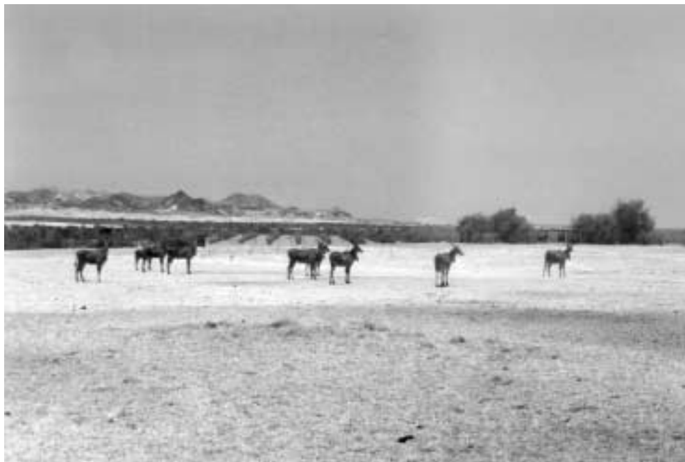
There are whole herds of deer and other animals on Baniyas Island, fed by grass farms on the island itself. The project was launched at the initiative of Sheikh Zayed in the 1970s, with the construction of a large desalination plant on the coast, and underwater pipelines linking the plant over 8 km to the island.

physical changes caused by mankind's deliberate action, which contribute to increasing the potential size of human population that can be sustained, at increasing levels of material living standards and longevity, on a given area or region of the Earth's surface. Those changes are closely connected with the development and improvement of basic economic infrastructure—including energy, water system, transport, communication, etc.—leading (among other things) to an increasing intensity of production and consumption of energy and other infrastructural services per capita and per unit area.