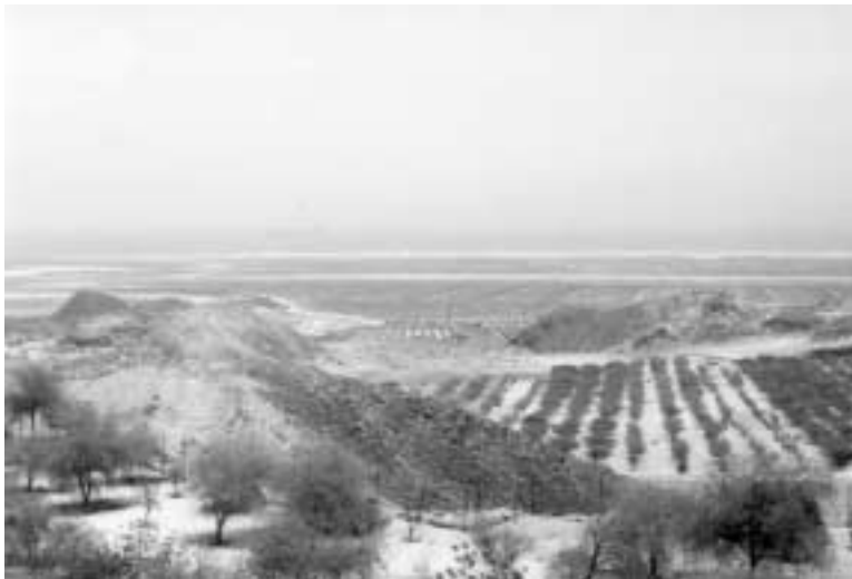
View of Baniyas Island, showing how the desert is being cultivated. Water is provided to each plant, using the so-called droplet method, by a huge network of pipes. Twenty-five years ago the island was almost completely barren, with virtually no plant or animal life.

He explained how relatively small shifts in solar output, and phase-shifts in sunspot cycles, have major influences on the Earth's atmosphere.