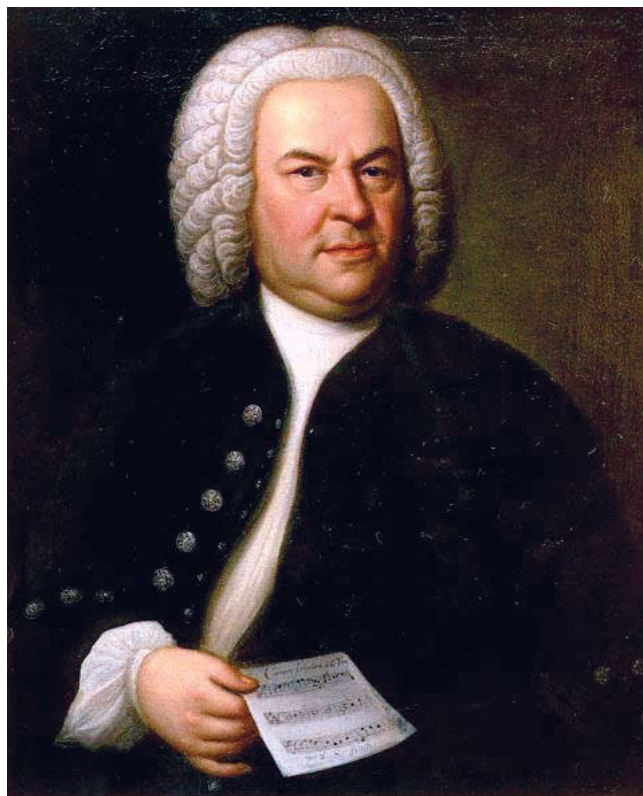
Johann Sebastian Bach (1685-1750) was the “teacher” of all the brilliant composers of the 19th Century. Much of his work had been buried until the Mendelssohn-Schumann circle of collaborators rediscovered it.

Today it is already 14 days that we have been married! How beautifully and happily we've spent these days! But this week we were also fairly busy. Our fugal studies are continuing; every time we play one it becomes more interesting for me. Such great art with such a natural flow; one can say this about almost every one of the fugues. Compared to Bach's, Mendelssohn's fugues really strike one as impoverished, also it is too apparent how they are made, and how difficult it probably was for him at times. Perhaps