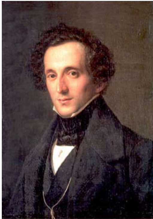
Felix Mendelssohn was a close collaborator of the Schumanns, sharing with them the project to revive the works of Bach. Referring to himself and collaborator Eduard Devrient, an actor, Mendelssohn said: “To think that it took an actor and a Jew’s son to revive the greatest Christian music for the world!”

...I feel that my path is fairly solitary; no acclaiming crowd inspires me to fresh effort, but I keep my eyes fixed on my great examples, Bach and Beethoven, whose far-off images give un-failing help and encouragement.... The human heart is often a strange spectacle in which sorrow