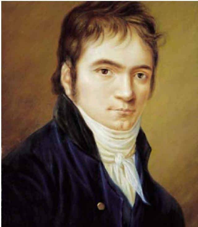
Ludwig van Beethoven in 1803, painting by Christian Hornemann. Robert Schumann studied Beethoven's work intensely, alongside that of Bach.