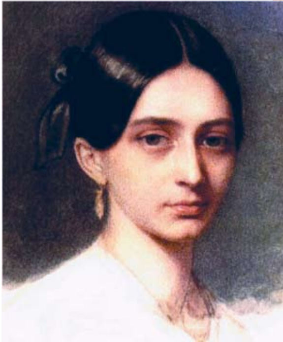
The creativity of musicians Clara and Robert Schumann was nourished by Bach, whose works they studied together during their honeymoon, and long after.