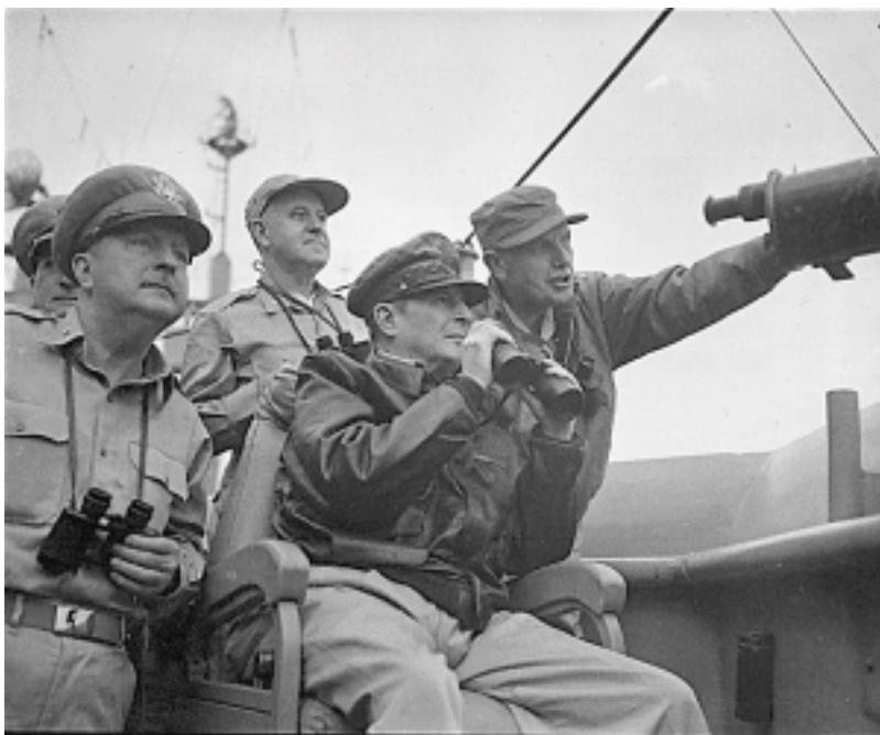
Gen. Douglas MacArthur (seated) and other officers observe the shelling of Inchon from the USS McKinley, Sept. 15, 1950. "Surprise," MacArthur told the naysayers in Washington, "is the most vital element for success in modern war."

conflict that the historic Battle of Inchon—with its attendant potential for ending the entire war—was won. The performance of the land, sea, and air components of MacArthur's assault force was incontestably brilliant on the day of the landing, and thereafter. But it was MacArthur's victory against the Joint Chiefs in the conference room which secured the basis for his troops' spectacular triumph on the battlefield.