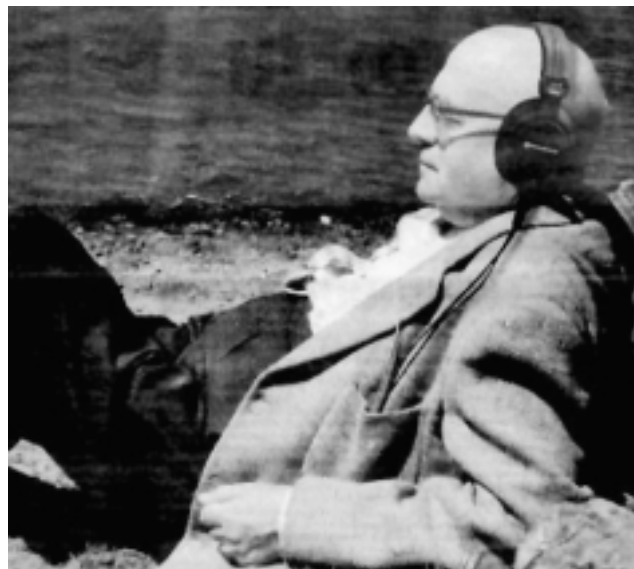
Hofstadter was much impressed with The Authoritarian Personality, a project directed by Theodor Adorno (shown here). LaRouche writes that Hofstadter and Adorno’s German existentialist circles, typify the generation of Liberals “which opened the gates before my eyes, for my clearer view of sundry sorts of Hellish tyrannies which I have witnessed in those times past.”

The Liberal’s faith is, essentially, his fear of lacking the power of suggestion to “win friends and influence people” honestly. He is often stickily gregarious, but never really