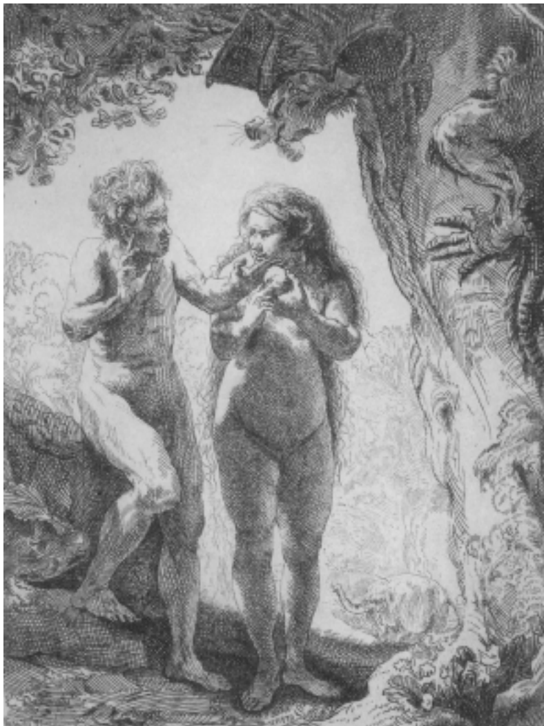
The distinction of human from animal life, writes LaRouche, “is the fundamental issue of economy, which separates my own commitment to truth from the prevalent, Liberal, views and practice of political-economy today.” Here, Rembrandt’s “Adam and Eve” (1638). Rembrandt portrays the couple paradoxically, as not yet fully human, not yet enlightened by reason. The viewer is led to ponder the necessary role of culture, in bringing human potential fully to life.

For example: were the human species a member of the category of higher apes, the population of our species could not have ex-