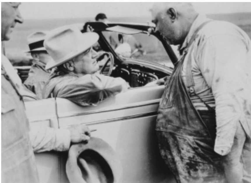
President Franklin D. Roosevelt in 1936, touring North Dakota. His orientation to “the forgotten man” was a sharp break from his predecessors. The changes introduced to the global economic system under his successor, Harry Truman, “have been the single most important of the ‘hereditary’ factors in shaping the long-wave course of world history” since FDR’s death, LaRouche writes.

except at risk of a general catastrophe which would sink the entire economy of the world into a virtual dark age. The only acceptable remedies would be changes within the U.S. system itself. It is the system presently associated with the dollar which must now be radically changed. There is presently no other visible solution.