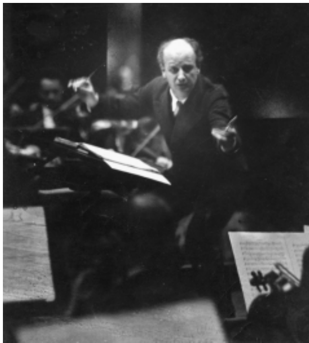
The contrast between intellectual life and death is vividly exemplified by the difference in musical performance by German conductor Wilhelm Furtwängler (shown here) and others, such as Bruno Walter.

The quality of experience which bespeaks the ontological actuality of the human individual soul within the real universe, is associated with the quality called ambiguity . Often, of course, ambiguity is associated with the notion of indecision, of doubt; but, it is expressed, as in the competent practice of physical science, by the presence of a principle, as Kepler's rigorous, successive steps in his New Astronomy discover a universe which rules the world of mere sense-certainty, as if from outside the credulous ignorant mind's dream of sense-certainty.