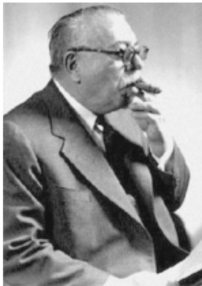
Norbert Wiener’s promotion of “cybernetics” was a conscious attack on the Classical scientific method of Johannes Kepler. Among his collaborators: Gregory Bateson, Margaret Mead, John von Neumann, Kurt Lewin, and Max Horkheimer, the head of the Frankfurt School.

It was from this network that the utopian concept of “artificial intelligence” was posited, as an outgrowth of cybernetic systems research.