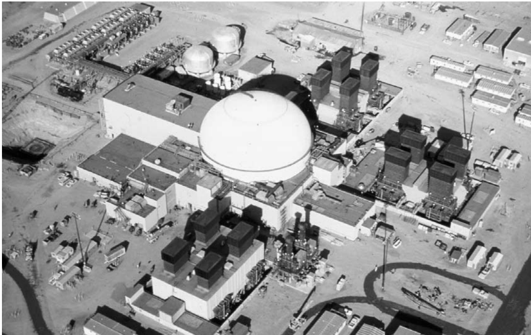
The Fast Flux Test Facility at Hanford, Washington, is a 400-megawatt sodium-cooled fast reactor of the type GNEP proposes to develop. It was designed to test new reactor fuels and materials, but it was shut down by the DOE just months before GNEP was announced. Now, it could be restarted.

fast—with nuclear? Will we bury our heads in the sands of bureaucracy and continue to “study” and talk about the issue, as the NAS committee recommends? Will we inch along, inventing a new recycling process, and building a new facility based solely on an unproven and misguided goal of preventing proliferation? Neither GNEP nor the NAS has a solution befitting the nation that pioneered civilian nuclear technologies and, under the Atoms for Peace program, trained hundreds of nuclear engineers and scientists from around the world.