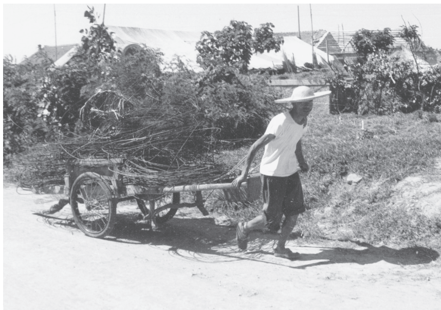
Above: A picture taken by Helga Zepp-LaRouche in August 1971 outside Shanghai—at the peak of the Cultural Revolution—shows typical transportation.

According to World Bank statistics, China has been the second largest economy in the world, in terms of GDP, since 2018, but number one in terms of per capita purchasing power. Since 2015, China has had the largest middle class in the world, and President Xi Jinping has personally committed himself to freeing the approximately 4 million people still living in extreme poverty in China from that plight by the end of 2020. Neither Europe, with some 90 million people living in poverty, nor the United States, where 40 million are considered poor, has a comparable program.