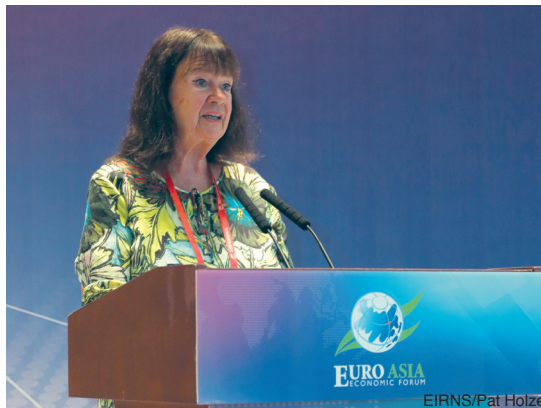
Helga Zepp-LaRouche addresses the 2019 Euro-Asia Economic Forum Think-Tank Meeting in Xi'an, China on September 11, 2019.

In fact, China has opened a new, totally inspiring