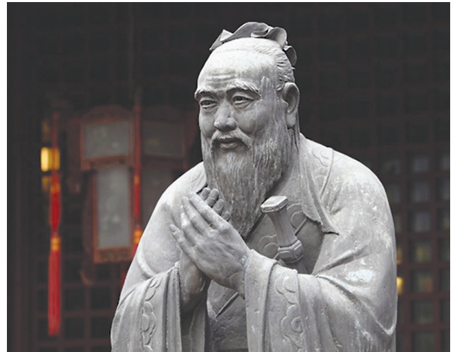
China has a very different social system, a meritocracy developed over more than two millennia, based on the Confucian tradition. Shown, statue of Confucius at Confucian Temple in Shanghai, China.

One of the most essential differences between the culture of not only China but all of Asia, and that of the West, is the priority placed for thousands of years on the common good of society over the unrestrained rights of the individual. Behind this is the conviction that the individual and the family can only do well if the state as a whole is doing well. The outstanding importance of individuality, as it developed positively from the Renaissance and European humanism, but negatively from the ideology of extreme liberalism (“anything goes”), is much less important in China. This historical cultural difference, deeply rooted in the Asian tradition, is the primary reason why the idea that China would automatically adopt the system of Western democracy after joining the World Trade Organization (WTO) was