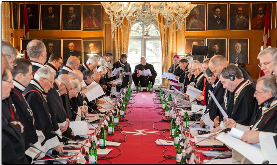
Figure 6: Elected government of the Sovereign Order of Malta. The Sovereign Council assists the Grand Master in the government of the Order of Malta. It is composed of the Grand Master, who presides over it, the holders of the four High Offices (Grand Commander, Grand Chancellor, Grand Hospitaller and Receiver of the Common Treasure) and six members. Knights of Malta. (Accessed May 19, 2020). Sovereign Council. Order of Malta. https://www.orderofmalta.int/government/sovereign-council/