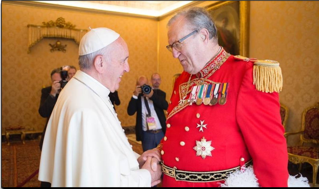
Figure 3: Press Release. (June 23, 2016). Pope Francis Received the Grand Master of the Sovereign Order of Malta in Audience. Order of Malta. https://www.orderofmalta.int/2016/06/23/pope-francis-receives-the-grand-master-of-the-sovereign-order-of-malta-in-audience/