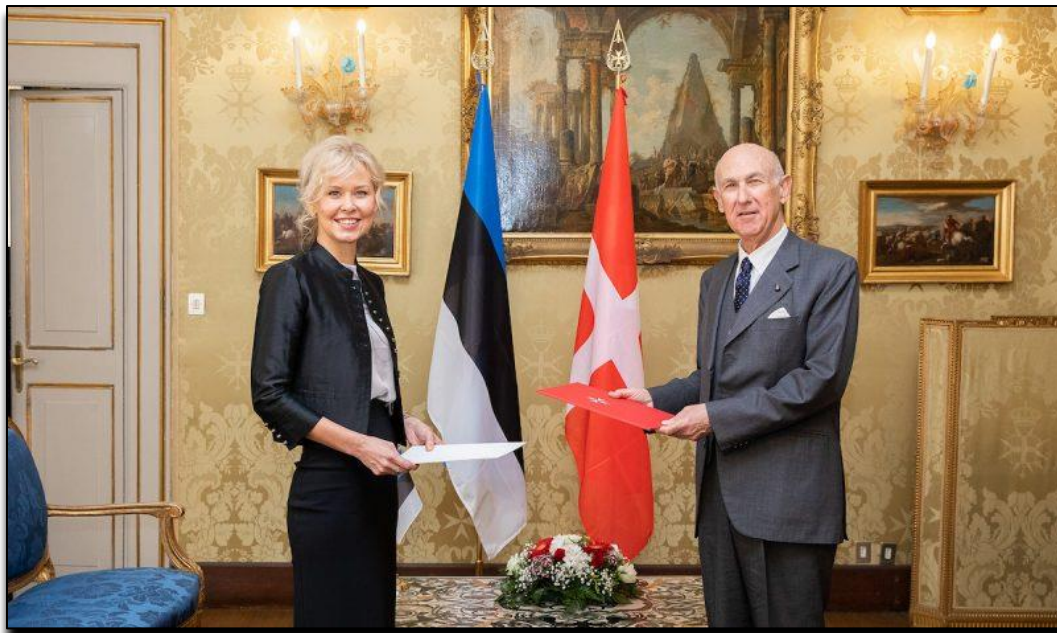
Figure 8: Press Release. (March 11, 2020). Estonia and Sovereign Order of Malta