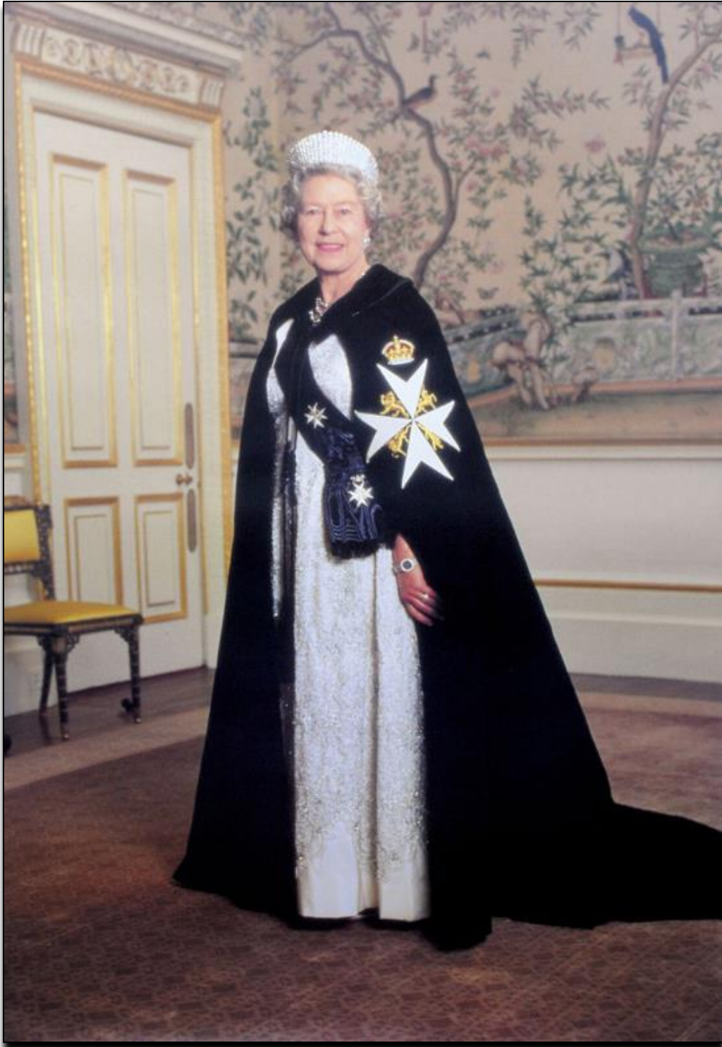
Figure 4: Queen Elizabeth in her Knights of Malta regalia.