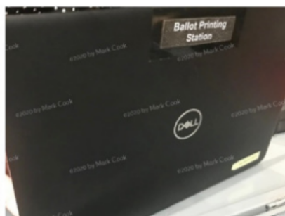
Ballot designer computer, connected to ballot printer.