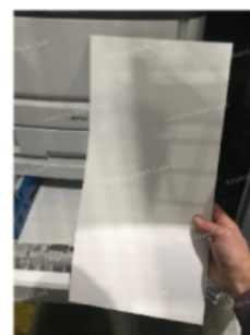
Ballot printer loaded with blank ballot paper.