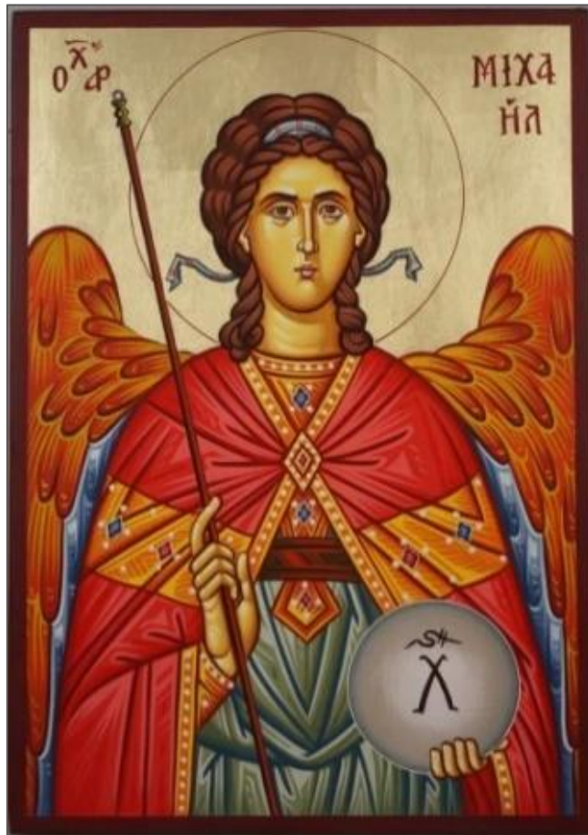
Figure 8: St. Michael the Archangel.

2011 An excavator discovered what is believed to be The Holy Spear of Antioch, along with other Raymond of Saint-Gilles' and his son Alfonso Jordan's River Jordan possessions buried in Vienna; See 1098 (Jun 14), 1099 (Jul)