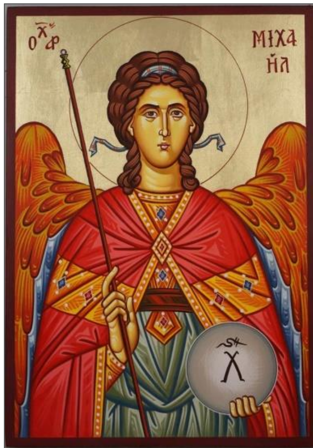
Figure 12: St. Michael the Archangel.