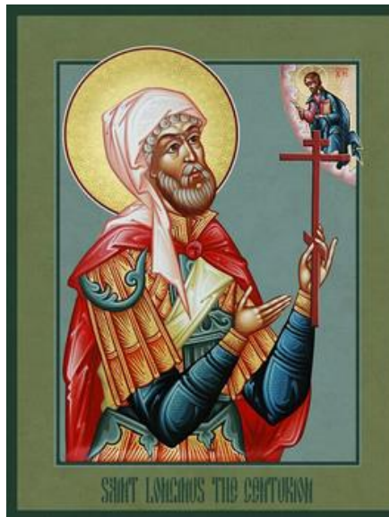
Figure 10: Icon of St. Longinus

Perhaps to our detriment, martyred Peter Bartholomew is not yet remembered liturgically by the Church, but we remember him here. Whether or not he was a zealot, he nevertheless sacrificed his life to prove his honorable intentions and to honor Christ. For what it is worth, this researcher believes Peter does not deserve the derisive treatment that so many impious observers have heaped upon him these last 1,000 years. The question is why?