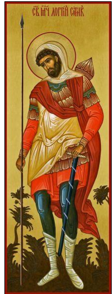
Figure 2: St. Longinus. Saints Book - Orthodoxy

161-180 Emperor Marcus Aurelius persecutions 40