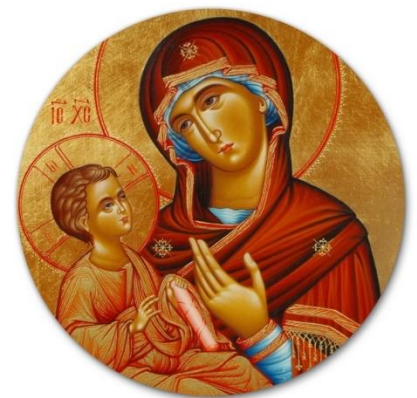
Figure 3: Icon of the Virgin Mary, Theotokos—the Mother of God; affirmed by the Fifth Ecumenical Council in Constantinople (553AD)