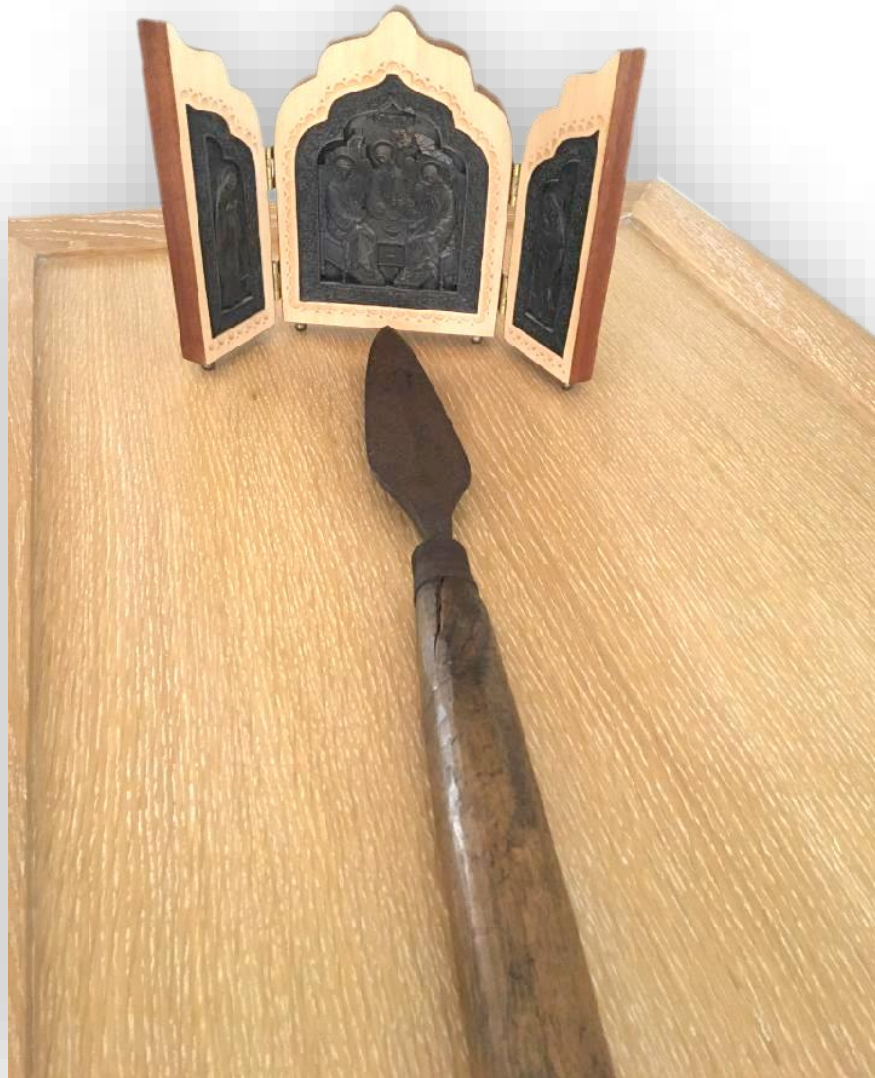
Figure: 10: The Holy Lance of Antioch, 2021. Verified as a genuine 1 st century Roman centurion's spear in unprecedentedly good condition (lovingly cared for). The shaft is 7 th century ash, likely an Antiochian Orthodox Christian liturgical mount likely crafted before the fall of Antioch in 637 A.D. The relief icon triptych is from Moscow, Russia (1995), Cathedral of Christ the Saviour (then under construction), unknown carver, displaying The Holy Trinity (center), The Theotokos (Virgin Mary, left) and St. John the Baptist (right).