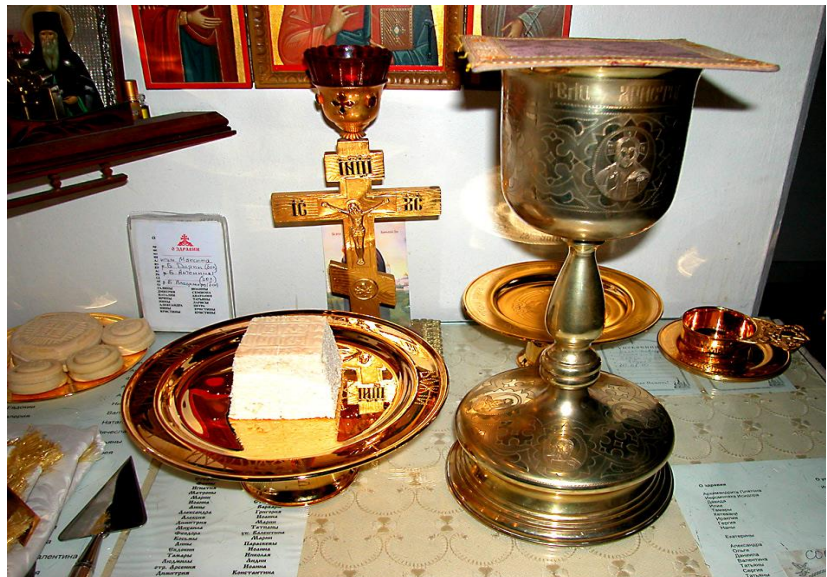
Figure 11: The Orthodox Christian Proskomedie (Greek προσκομιδή) preparation of the bread and wine for the Eucharist. The liturgical spear is shown on the bottom left. It is a permanent part of every Eucharistic celebration of the Orthodox Christian Divine Liturgy in the world.