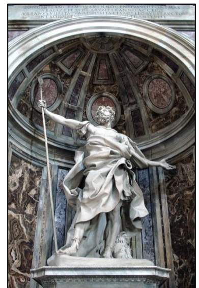
Figure 5: Saint Longinus in Saint Peter's Basilica by Bernini.