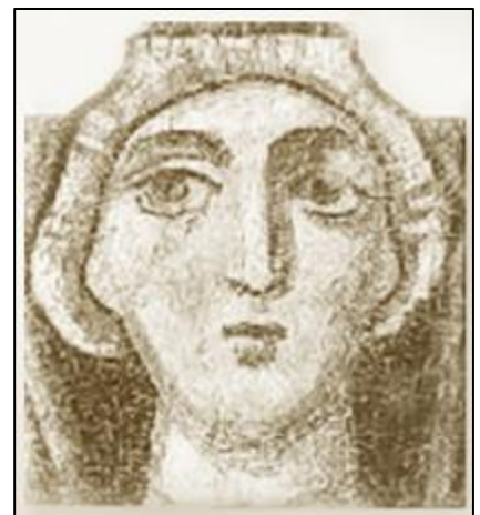
Figure 6: Anna Komnene, chronicler of the First Crusade; historian, physician, intellectual, scholar.