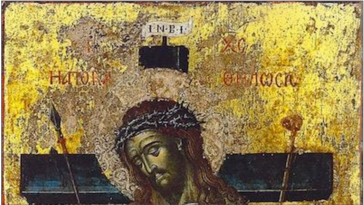
Figure 9: When the centurion and those who were with him, keeping watch over Jesus, saw the earthquake and what took place, they were filled with awe, and said, “Truly this was the Son of God!” Matthew 27:54 (From the Gospel of Vespers on Good Friday Afternoon). Icon: Unknown Writer.

Jesus Christ is the nexus between God and humankind.