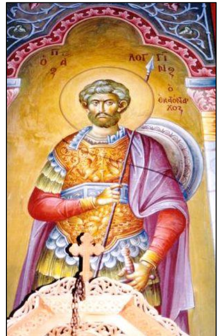
Figure 1: St. Longinus icon, Rome Across Europe.

Apostle Peter concealed the Passion relics in Jerusalem (e.g., lance, crown of thorns, platen, garments, objects from Christ's