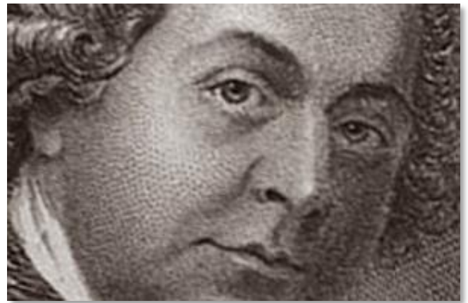
Figure 1: John Adams (1778): “The moment the idea is admitted into society that property is not as sacred as the laws of God, and that there is not a force of law and public justice to protect it, anarchy and tyranny commence. If ‘Thou shalt not covet’ and ‘Thou shalt not steal’ were not commandments of heaven, they must be made inviolable precepts in every society before it can be civilized or made free.

Nip the shoots of arbitrary power in the bud is the only maxim which can ever preserve the liberties of any people.”