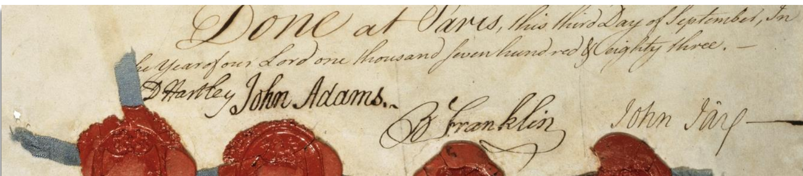
Figure 2: Treaty of Paris. (Sep. 03, 1783). Founders Online.

Nip the shoots of arbitrary power in the bud is the only maxim which can ever preserve the liberties of any people.”