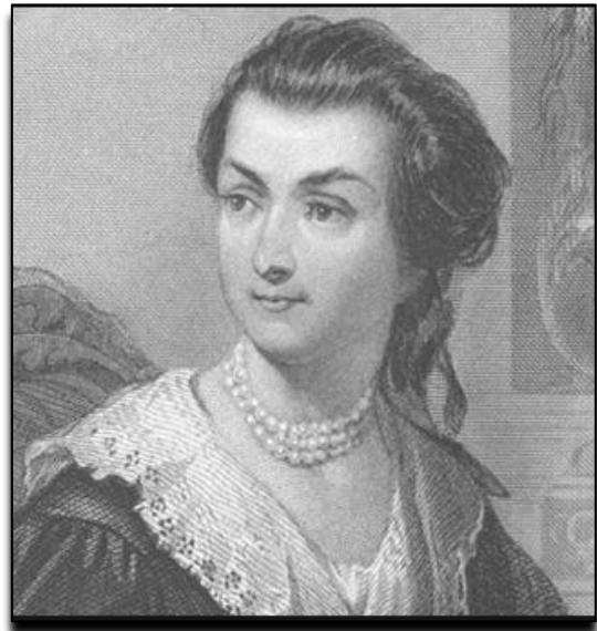
Figure 3: Abigail Adams (1744-1818).