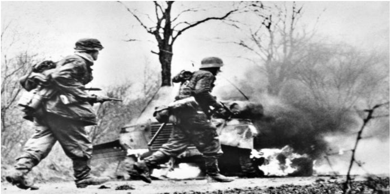
Scene from the Battle of the Bulge.

confrontation in the Ardennes represented a serious setback for the Americans. Von Rundstedt's counteroffensive did eventually end in failure, but initially the German pressure was considerable.