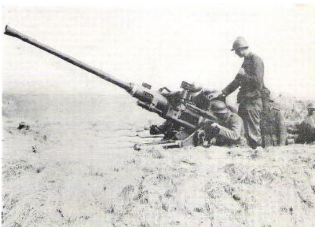
Image on the right: Belgian anti-aircraft gun, circa 1940

By May 9th, thousands of German vehicles and marching troops could actually be heard approaching the frontier. Before midnight on May 9th/10th, the French, Dutch and Belgian governments were all informed of large German troop concentrations close by. General Gamelin even learnt the correct date of the attack, May 10th, but still did nothing (7). As he said, they preferred “to await events”. Their waiting was almost over.