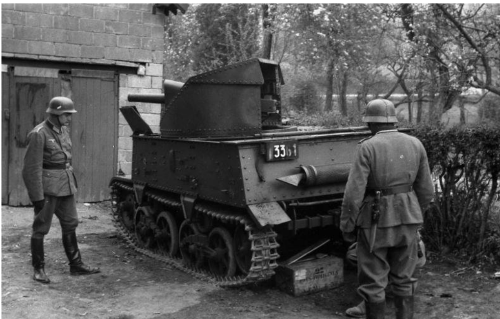
An abandoned Belgian T-13 tank destroyer is inspected by German soldiers.

On the morning of May 13th Stuka dive bombers, with their mournful and piercing siren, arrived in 12 squadrons above Sedan (8). The Stuka was a poor military aircraft, with a flying distance of less than 400 miles and capable of holding only a light payload of bombs; but its siren had a devastating impact on the morale of French soldiers stationed along the Meuse, that was out of proportion to the damage imparted. With the stukas starting to dive, the French artillery fell silent as the gun crews took cover, cowering and demoralised in their bunkers (9). A mere 56 casualties were inflicted by the Luftwaffe bombardment, and none of the bunkers on the far side of the Meuse had been hit.