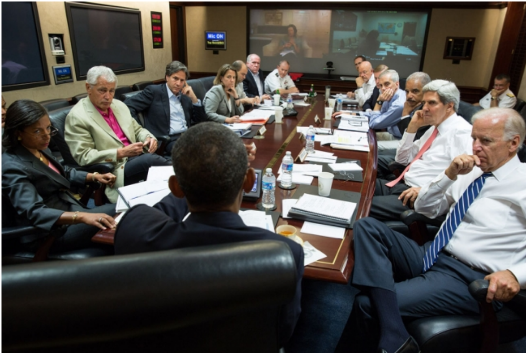
President Barack Obama meets in the Situation Room with his national security advisors to discuss strategy in Syria, Aug. 31, 2013.

The Trump administration had just announced a U.S. policy reversal, saying that the U.S. goal was no longer "regime change" in Syria but rather to defeat terrorist groups. At the time, Al Qaeda's Nusra Front, the Islamic State and other jihadist forces were in retreat across much of Syria.