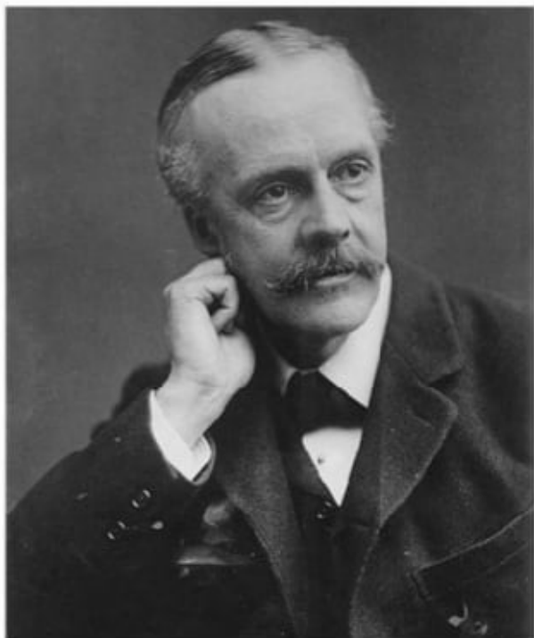
Arthur James Balfour (1848-1930)