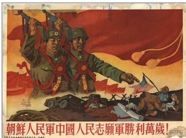
VPA Poster, 1950

Truman had contemplated the use of nuclear weapons against both China and North Korea, specifically as a means to repeal the Chinese Volunteer People's Army (VPA) which had been dispatched to fight alongside North Korean forces. [Chinese Volunteer People's Army, 中国人民志愿军; Zhōngguó Rénmín Zhìyuàn Jūn].