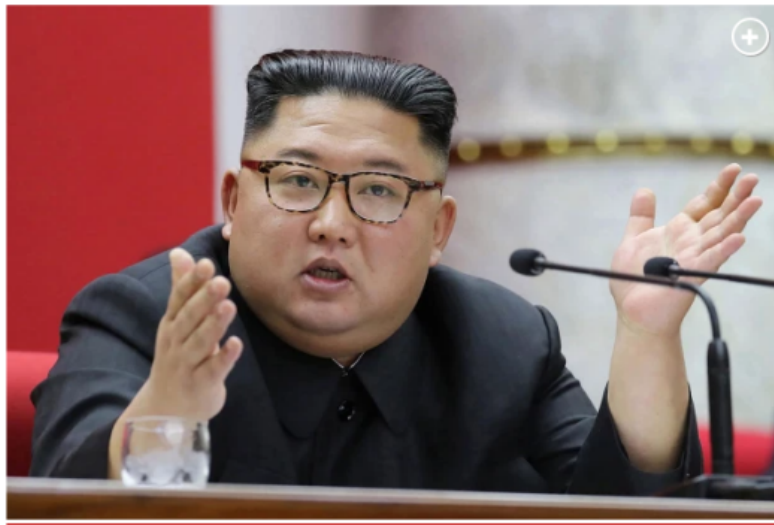
Kim Jong Un