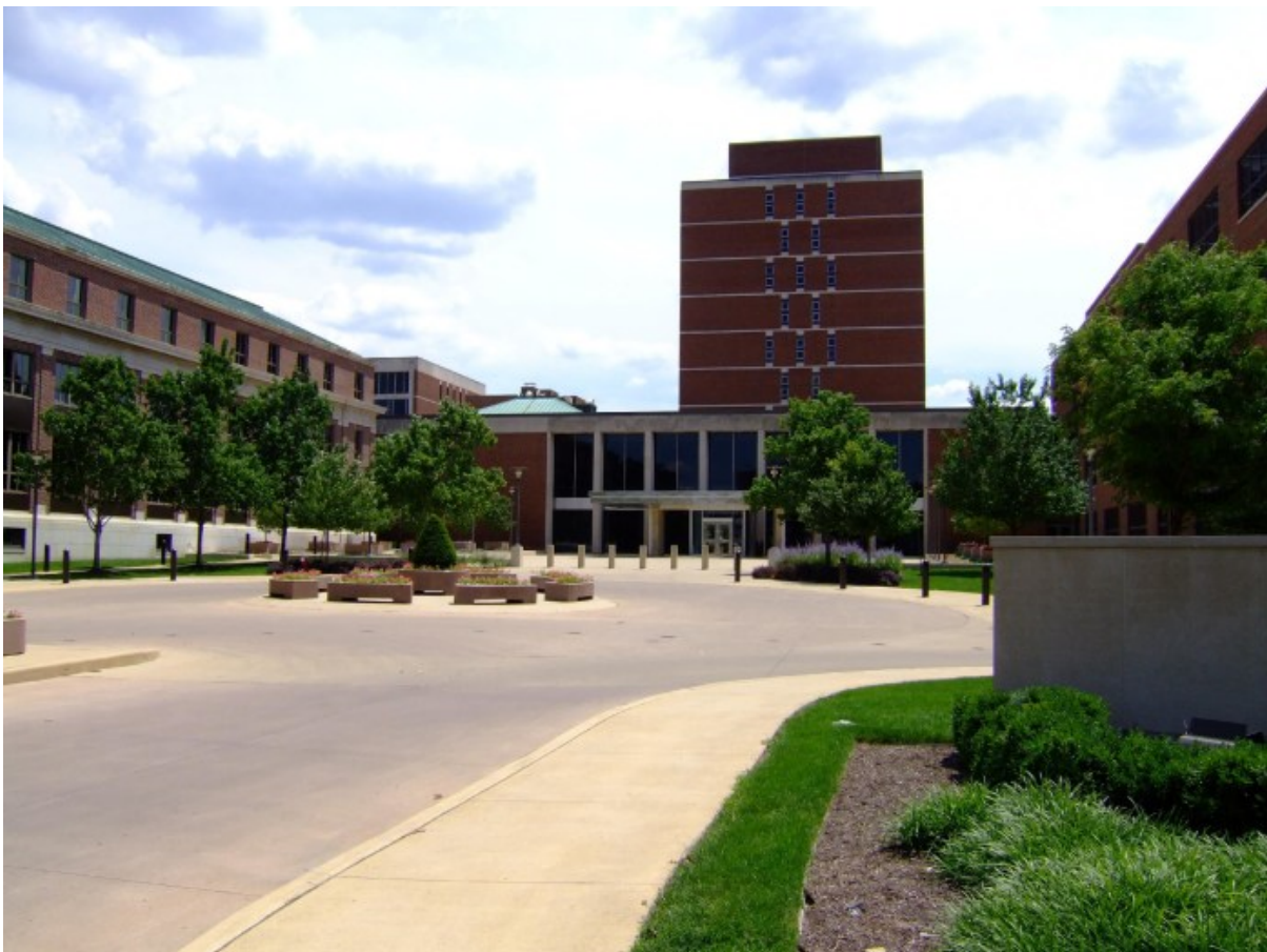
Batelle Memorial Institute.

There have been several developments since my book was written, two of which are especially important.