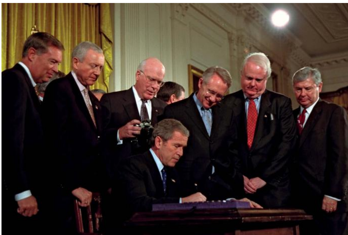
George W. Bush signs the USA PATRIOT Act

The attacks on Congress were, of course, successful. Congress was disciplined and meekly passed the Act.