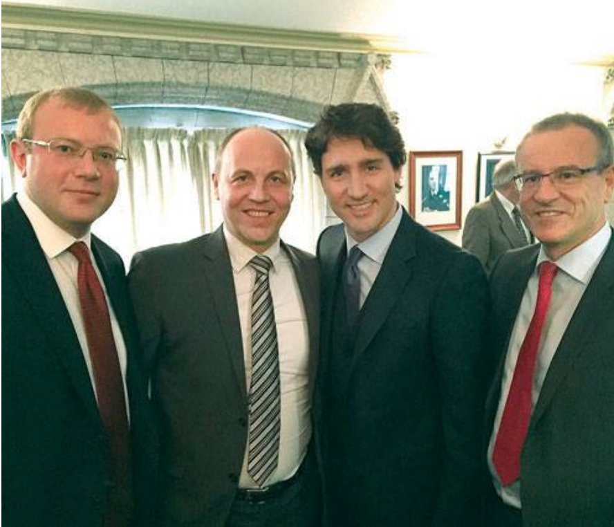
February 23, 2016, Parubiy, second from Left meet PM Trudeau