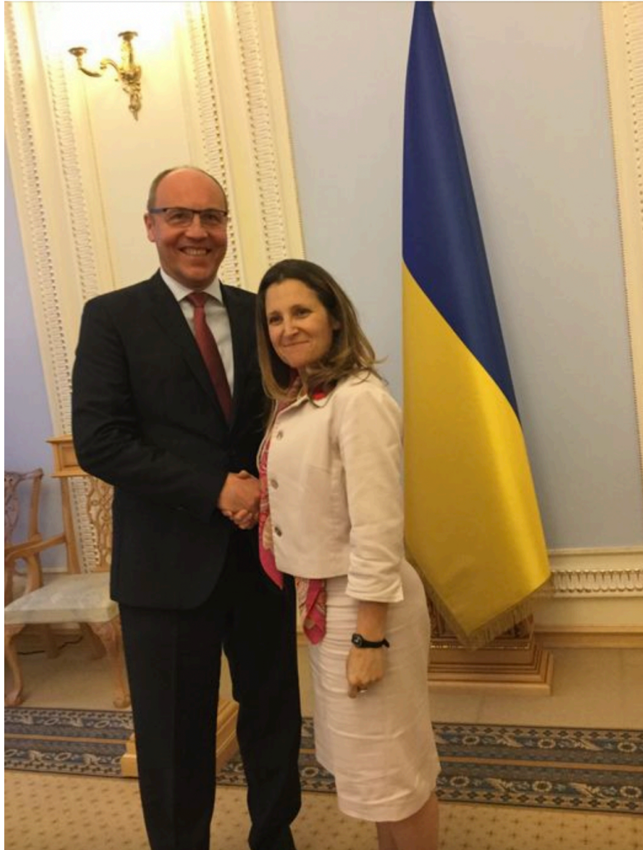
Chrystia Freeland's Facebook, May 2019

Rencontre avec Andriy Parubiy, le président de la Verkhovna Rada. Nous avons discuté du rôle joué par les observateurs électoraux canadiens lors des élections présidentielles de l'Ukraine et qu'ils tiendront à nouveau lors des élections législatives plus tard cette année. Le Canada se tient aux côtés de l'Ukraine et de sa démocratie dynamique!