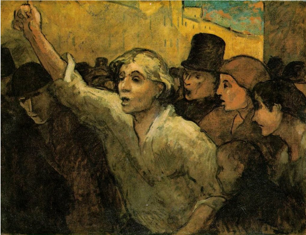
Le Soulèvement ( The Uprising ) by Honoré Daumier

However, another painting, The Installation of Captain Rock (1834), by the Irish artist Daniel Maclise (1806–1870) in the National Gallery of Ireland, depicts the protagonist with a raised, clenched fist as a political sign fourteen years earlier than Daumier's revolutionary painting, surely demonstrating that the depth of oppression of colonialism in Ireland had already produced self-conscious radical political groups.