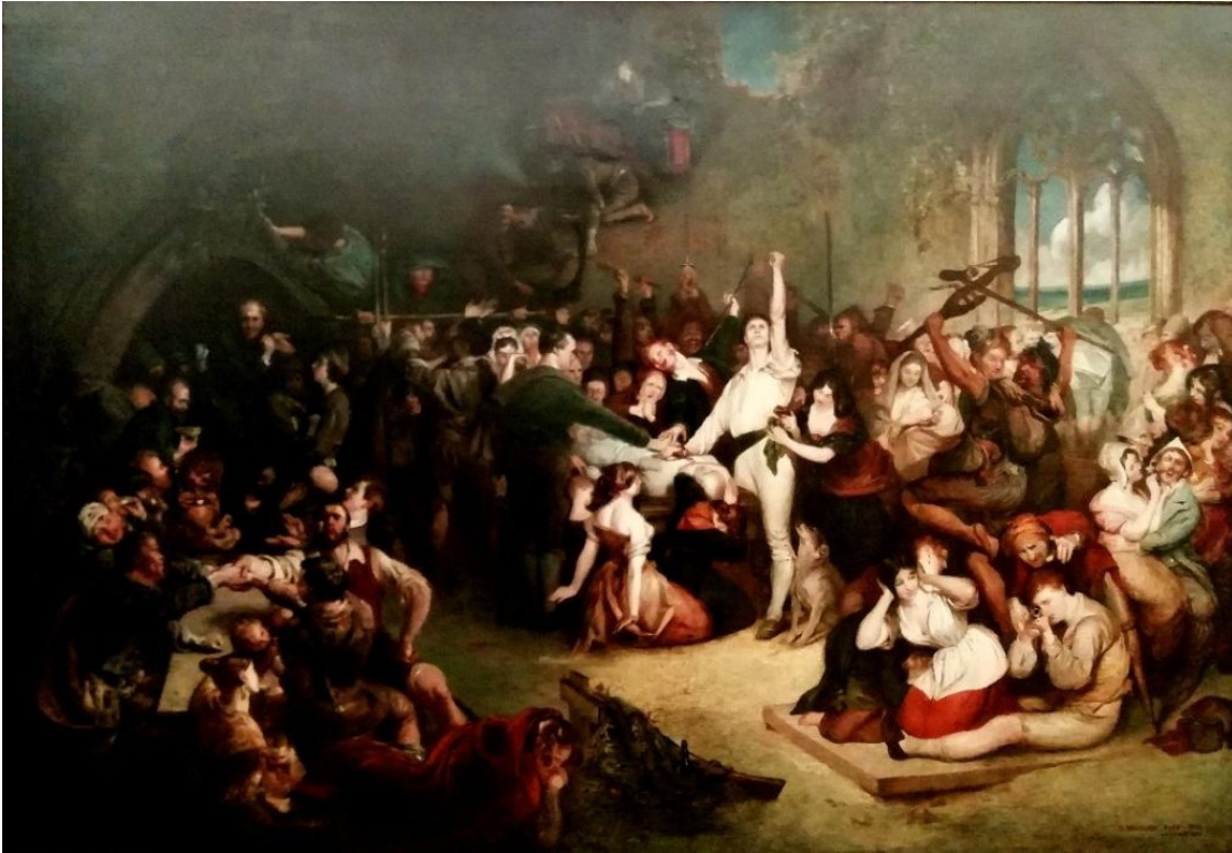
The Installation of Captain Rock (1834) by Daniel Maclise (1806-1870)

These agrarian groups “issued warnings of violent reprisals against landlords and their agents who tried to arbitrarily put up rents, collectors of tithes for the Anglican Church of Ireland, government magistrates who tried to evict tenants, and informers who fingered out Rockites to the authorities,” and involved many incidents of murder, arson, beatings and mutilation of cattle.