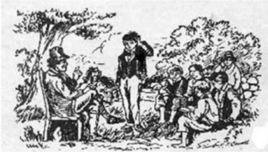
A depiction of a 19th century hedge school.

In the painting Maclise depicts the scene as a joyous occasion within a hall where many groups of ordinary people are busy getting on with life, yet plotting revolution. To the left a group is making a pact signified by their collective hand grasp, while behind them in a dark alcove appears to be a hedge school master surrounded by listeners and readers. To the right of the hall there is much merriment as a man and a woman dance wildly. Our eyes are drawn around a distracting group of young lovers as we suddenly realise that a gun is being pointed right at us by a young man in front who is just about to shoot (signified by a girl putting her hands to her ears), demonstrating that youthful 'fun' should never be underestimated and can suddenly turn deadly serious.