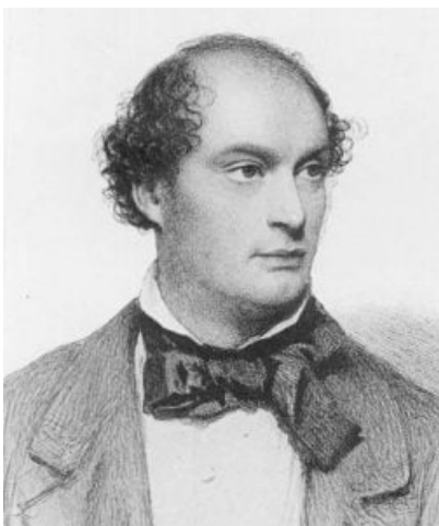
Image: 1857 lithograph of Daniel Maclise by Charles Baugniet

Maclise excelled in paintings of large groups of people engaged in various activities grouped