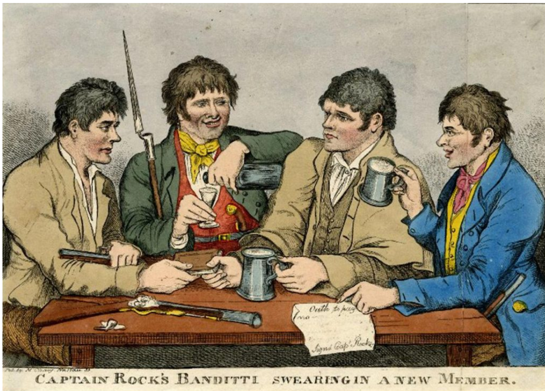
Captain Rock's Banditti – Swearing in a new member.