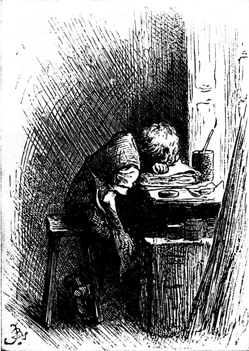
Dickens at the blacking warehouse, as envisioned by Fred Barnard

In the 1946 film, It's a Wonderful Life (directed by Frank Capra), children are associated with family scenes around the hearth but are shielded from potential financial disaster. It's a Wonderful Life also performed poorly at first, yet has also become a Christmas staple.