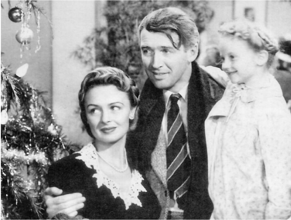
George Bailey (James Stewart), Mary Bailey (Donna Reed), and their youngest daughter Zuzu (Karolyn Grimes) in It's a Wonderful Life .

In A Christmas Carol the poor are everywhere but have no real consciousness of their poverty and struggle against poverty despite the odds. In It's a Wonderful Life the poor are depicted as belonging to a community but gradually grow more conscious of their weak position and unite to defend themselves.