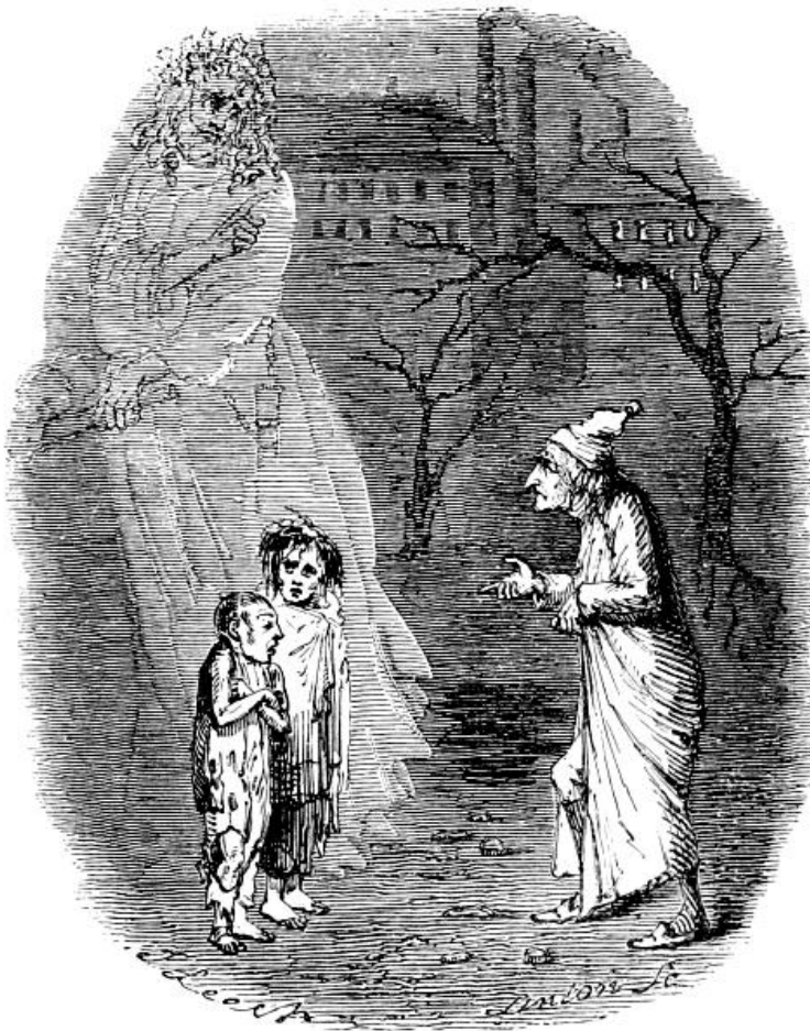
Ignorance and Want from the original edition of A Christmas Carol , 1843

Of course, while the children may be the focus of Dickens’ Christmas main story, they must not be aware that they are, thus retaining the sacred concept of childhood. Therefore in the narrative the children are affected only indirectly through the changed habits of the adults. This was Dickens’ strategy – to show that the cruelty of the world and the preciousness of childhood could exist side by side. Thus the adults could change their realm, positively affecting the children’s realm, without the two realms interacting with each other, as happened in Dickens’ own childhood. Dickens’ story also added to the growing belief in the importance of childhood not only for children but also for stable adults as Scrooge was shown to have had a lonely childhood himself.