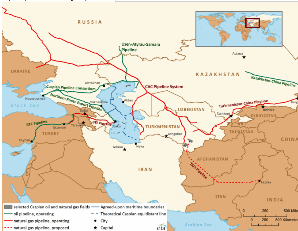
Major Caspian oil and natural gas export routes

Yet the Caspian has attracted increasing attention in Washington over the past 30 years. It was identified by high-ranking officials like Dick Cheney as critically important (7). The Pentagon sent abroad armed personnel from military organisations like Blackwater, with the aim of protecting the oil and gas pipelines in the Caspian region.