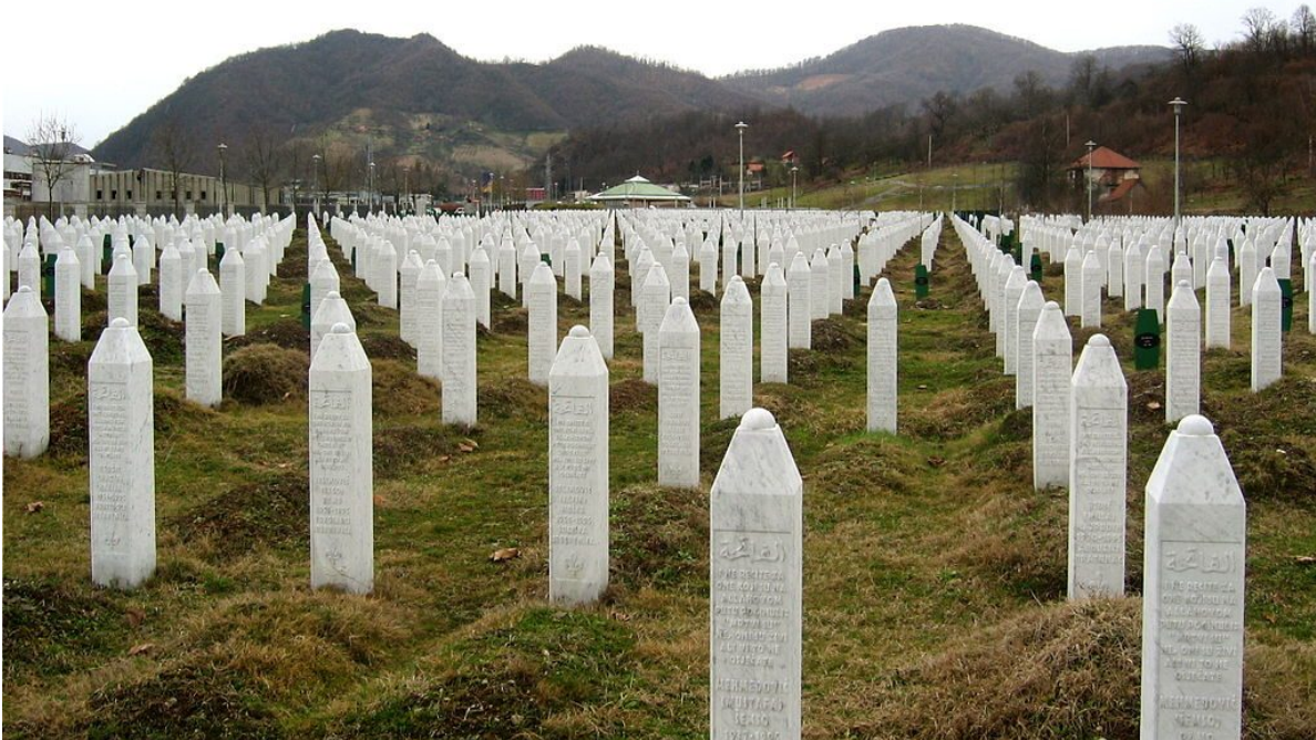
Gravestones at the Potočari genocide memorial near Srebrenica

sharp distinction, nicely elaborated by Josep Borrell, between the Garden and the Jungle. Even more to the point, where genocide is concerned, the distinction is between worthy and “unworthy” victims, as the late Prof. Edward Herman had insistently maintained.