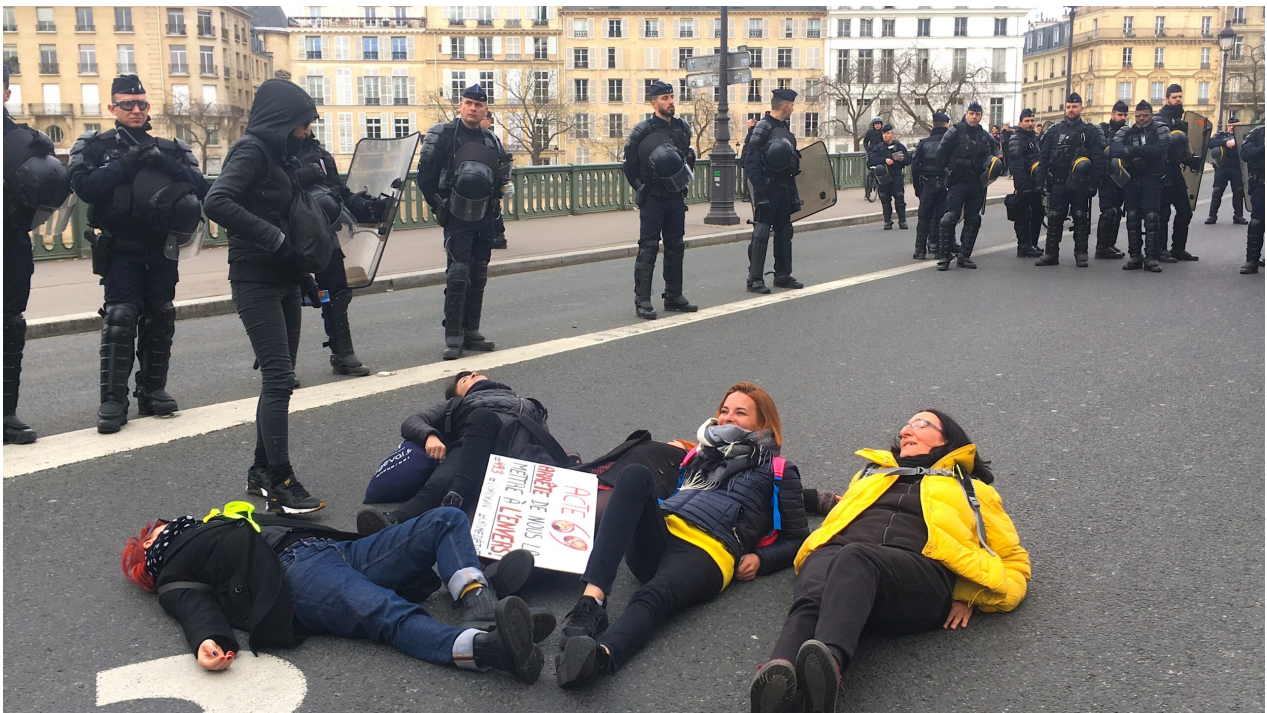
Yellow Vests protest, March 7, 2020 in Paris before lockdown.

In France, labor unions and progressives are demanding better protection of the population, starting with all those essential service workers, in hospitals and grocery stores, bus drivers, deliverymen, all those who are increasingly appreciated by their confined compatriots and who need to reap the benefits of their public service.