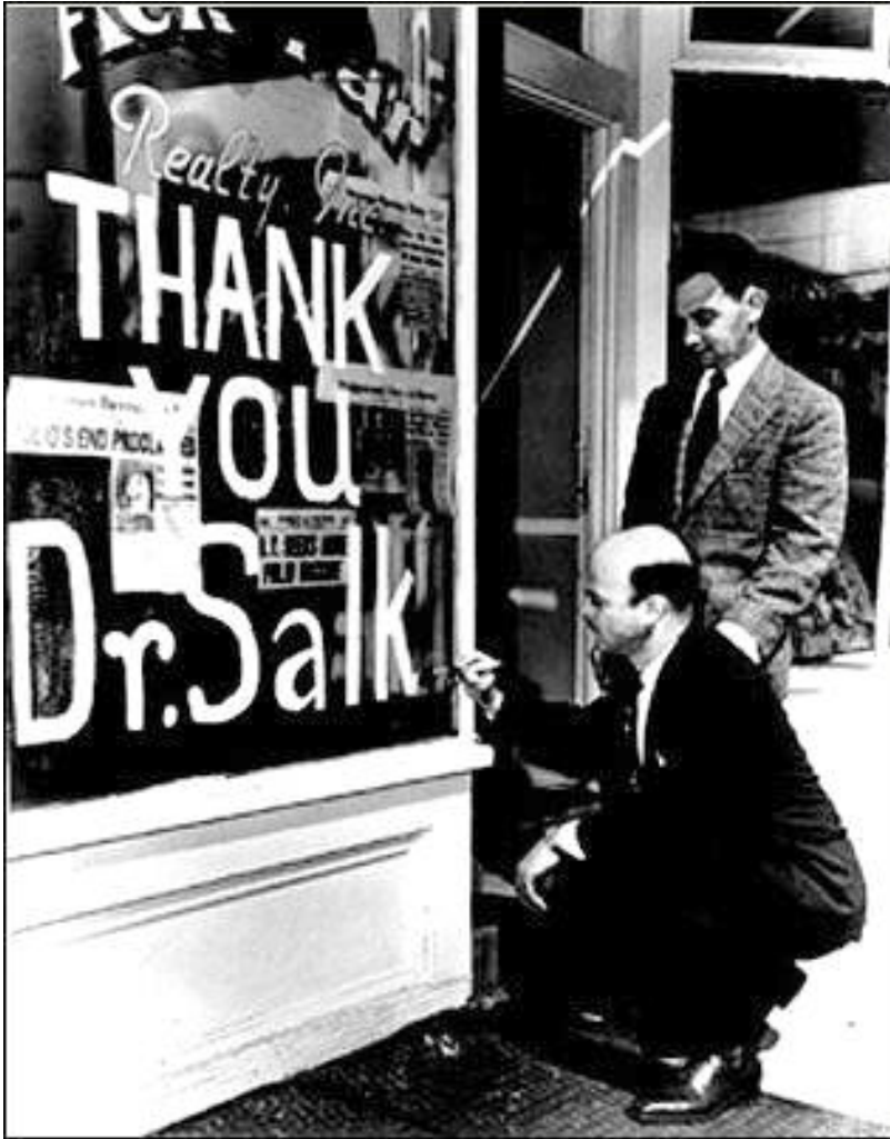
Jonas Salk's vaccine wiped out polio in the United States, and he didn't patent it.

Mass vaccination has always been the surest way to wipe out deadly diseases. It is also an instance where individual freedoms need be sacrificed to the general good. It is deeply disturbing that many intelligent people are more afraid of the vaccine that may be developed to combat this virus than they are of the virus itself.