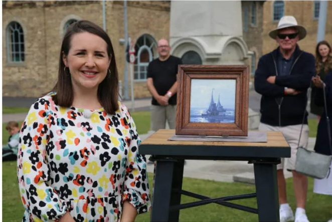
Antiques Roadshow's Theo Burrell has given an update on her terminal cancer diagnosis

Antiques Roadshow star Theo Burrell has shared a health update after being diagnosed with incurable brain cancer.