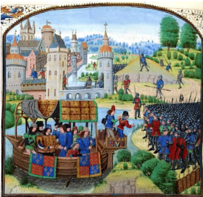
'Richard II meeting with the rebels of the Peasants' Revolt of 1381.