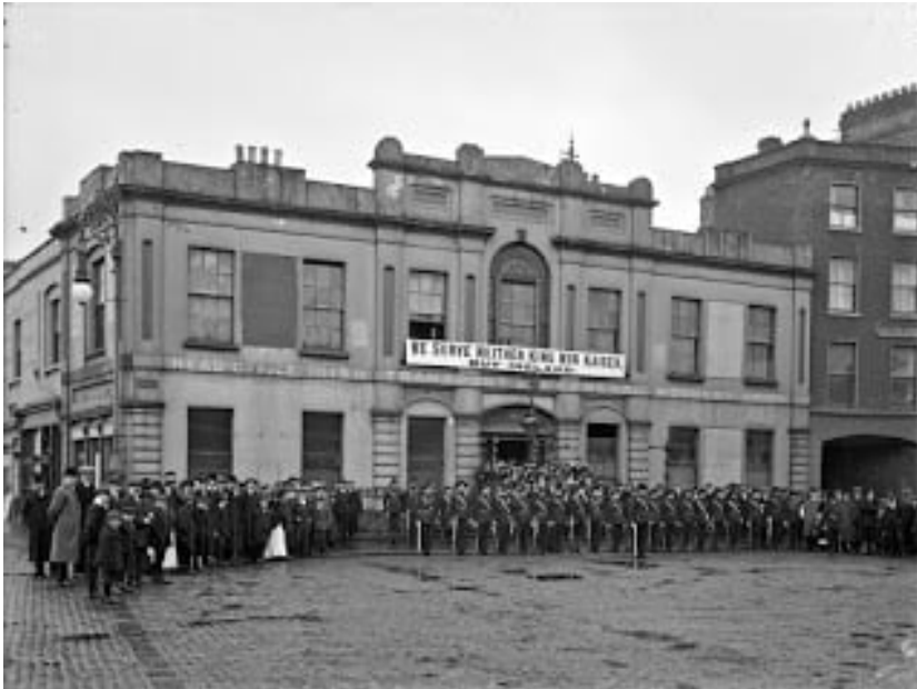
Irish Citizen Army group outside Liberty Hall. Group are lined up outside ITGWU HQ under a banner proclaiming "We serve neither King nor Kaiser, but Ireland!". Photo taken in early years of WWI.

The resistance often starts with strikes, boycotts, and civil disobedience, leading to mass movements of people who ultimately reject the old system of governance and change it for a new system which can be anti-colonial, anti-imperialist or anti-capitalist. The rise of resistance seems to generally develop in three stages, each affecting culture in very different ways. These different stages could be called criticism, substitution and implementation.