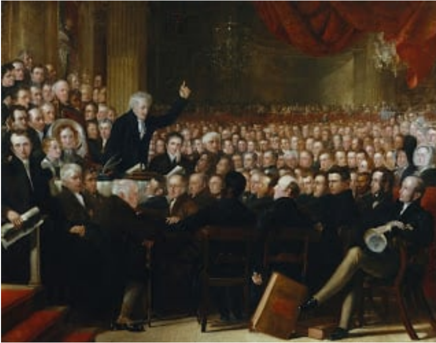
A painting of the 1840 Anti-Slavery Conference. The Anti-Slavery Society Convention, 1840, by Benjamin Robert Haydon (died 1846), given to the National Portrait Gallery, London in 1880 by the British and Foreign Anti-Slavery Society. Oil on canvas, 1841. 117 in. x 151 in. (2972 mm x 3836 mm). This monumental painting records the 1840 convention of the British and Foreign Anti-Slavery Society which was established to promote worldwide abolition.

However, a new movement in the arts and literature arose in the late 18th century, Romanticism, which emphasized inspiration, subjectivity, and the primacy of the individual. Romanticism was a reaction to the Industrial Revolution, aristocratic society and politics, and the scientific rationalization of nature. Romanticism became the basis of many subsequent cultural movements whose common feature has been anti-science and individualistic.