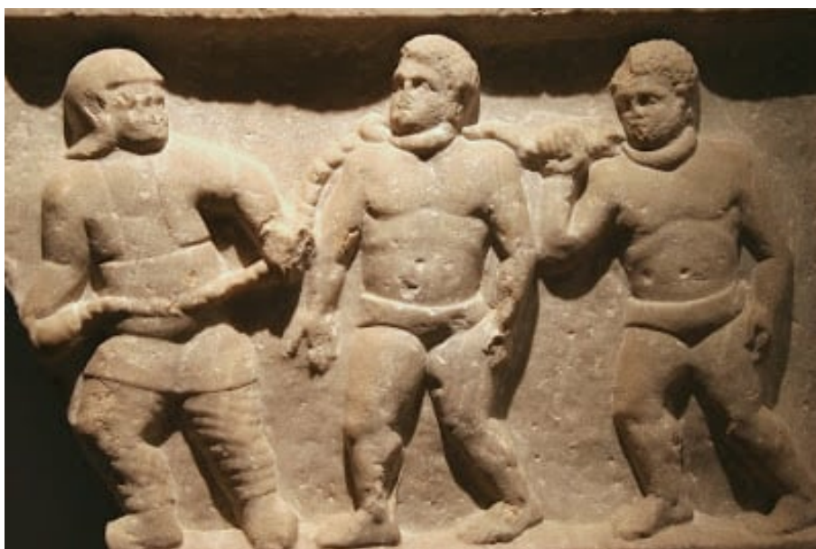
Slaves in chains during the period of Roman rule at Smyrna (present-day İzmir), 200 CE.

However, in general, people work in a globalized system of exploitation in states that support and maintain it thus making wage slaves of the 99 percent.