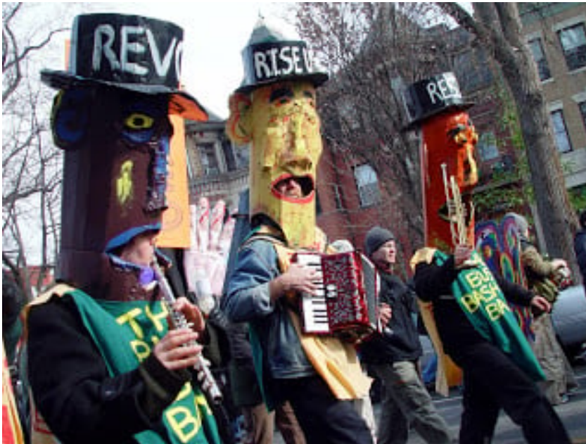
The Bash Bush Band musical protesters at Bush's 2nd inauguration, Washington DC.

change on the community level, developing the skills, community spirit, and artistic sensibilities of the community members whether they be producers, creators or observers. An important element of this strategy for social change is encouraging critical thinking through participation in active dialogue. General themes for discussion have been, for example, gender equality, human rights, the environment and democracy.