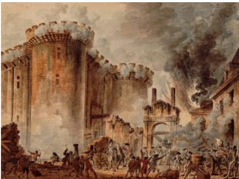
The storming of the Bastille, 14 July 1789, during the French Revolution.

These different levels of cultural change: criticism, substitution, and implementation can be a long process or all come together in a short span of time.