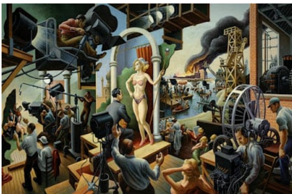
Thomas Hart Benton, Hollywood 1937-38 oil on canvas ; 56×84 in. (142.2×213.4 cm)

They believed that the production of culture had become like a “a factory producing standardized cultural goods — films, radio programmes, magazines, etc.— that are used to manipulate mass society into passivity.”