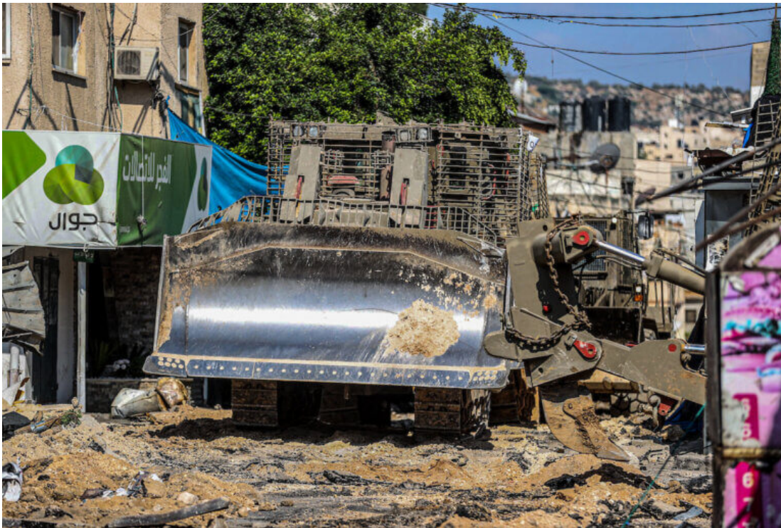
An Israeli military bulldozer seen leveling roads and destroying the center of the Jenin refugee camp during a raid on the camp near the West Bank City of Jenin, July 3, 2023.