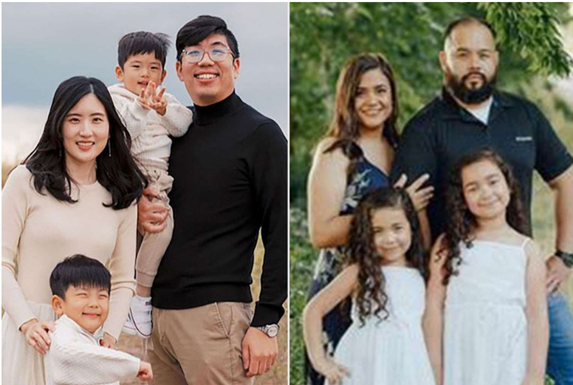
These are the victims of the Texas Mall Shooting

It all sounds very serious, doesn't it? It sounds like something that policymakers should be aware of so they can tighten regulations on these potentially-lethal medications. It also sounds like something that pharmaceutical industry would try to keep out of the newspapers so people don't see the connection between these drugs and the mayhem they produce. Simply put, the truth is being hidden for power and profits. What else is new? Here's more background from another article: