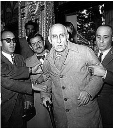
Image: Mohammad Mosaddegh in court, 8 November 1953

The first was the first democratically elected leader of Iran, Mohammad Mossadegh, certainly no communist. Mossadegh's offense was that he nationalized Iranian oil, thus angering the British government. He also angered the brothers. Sullivan & Cromwell's client, the J. Henry Schroder Banking Corp, was the financial agent for the Anglo-Iranian Oil Company on whose board Allen sat. The nationalization of Iranian oil also disrupted Foster's activities in behalf of Chase Manhattan Bank.