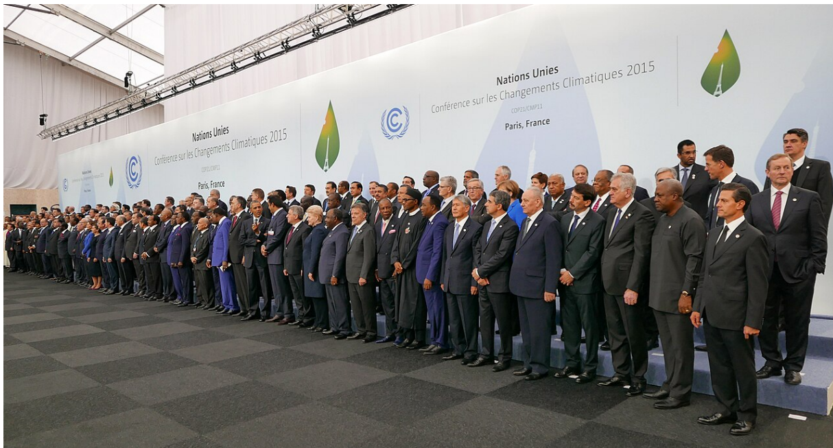
COP 21: Heads of delegations