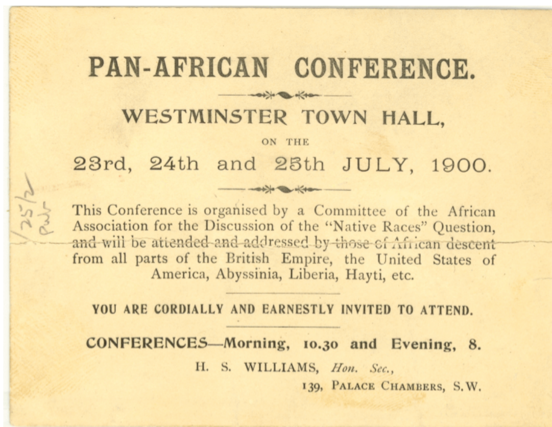
Pan-African Conference 1900 in London

so-called First Pan-African Conference was convened in London which attracted delegations largely from African descendants in the European, U.S. and Caribbean Diaspora.