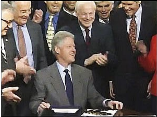
President Bill Clinton Laughs It Up as He Signs the Repeal of the Glass-Steagall Act. November 12 1999. Financial Services Modernization Act

One of the most famous derivatives in the era of the financial crash of 2007-2010 was described as mortgaged-backed securities. On the surface these bundles of debt-burdened properties might seem easy to understand. But that would be a delusion. The value of these products was affected, for instance, by unpredictable shifts in interest rates, liar loans extended to homebuyers who lacked the capacity to make regular mortgage payments, and significant shifts in the value of real estate.