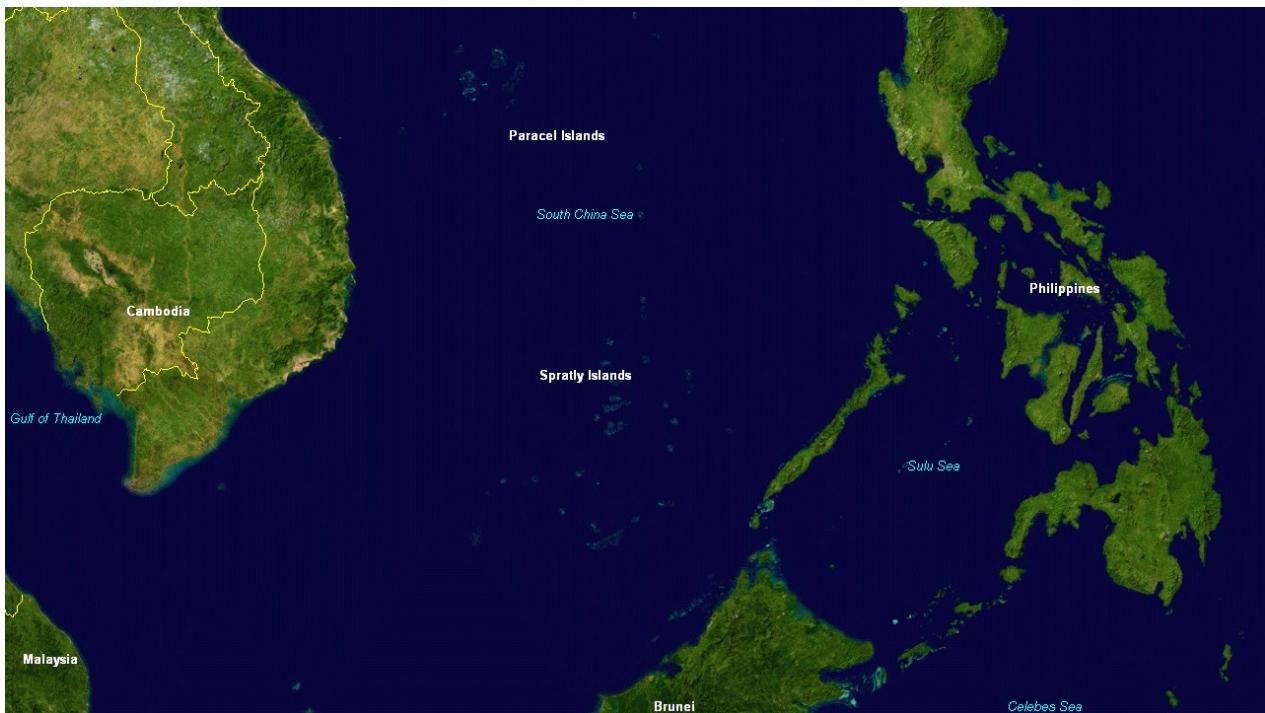
The location of the Spratly and Paracel Islands in the South China Sea.

Through its claims, the Philippines has, in part, sought to limit the nautical miles that China can claim for exploration and development. In fact, the Philippines brought the case against China to the Permanent Court of Arbitration tribunal exclusively as a maritime dispute and not a territorial dispute as an ipso facto means of extending the EEZ of the Philippines and reducing China's EEZ.