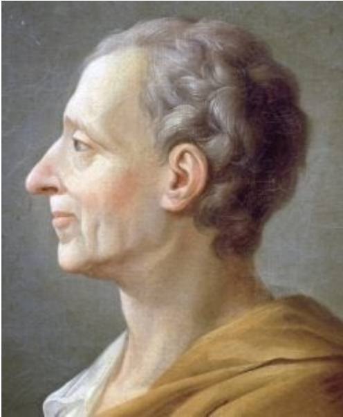
Image on the right: Charles-Louis de Secondat, Baron de La Brède et de Montesquieu (1689–1755), generally referred to as simply Montesquieu , was a French judge, man of letters, and political philosopher.

The patria was loosely connected to the concept of a republican government where the citizen, as Montesquieu wrote, would be asked to love the laws and the homeland ( patrie ) and that this love would require “continuing preference of the public interest over one’s own.” [3]