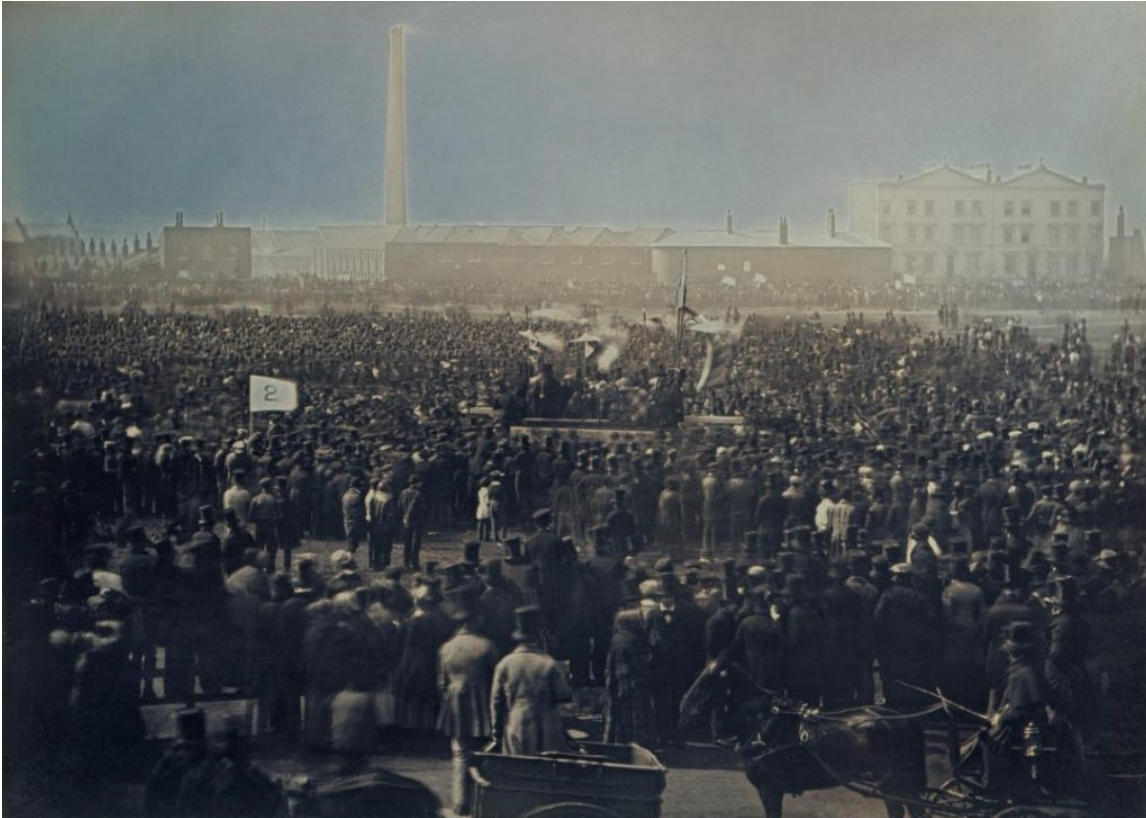
Photograph of the Great Chartist Meeting on Kennington Common, London in 1848

Equality before the law is a basic principle of legal documents like the Irish Constitution, for example: