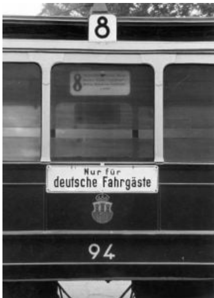
Image on the left: Nur für Deutsche (Eng. “Only for Germans”) on the tram number 8 in occupied Kraków

In post-revolutionary France linguistic redefinition took on serious political overtones as the question of self/other was redrawn along linguistic lines. Already the interests of the state were taking precedence over the rhetoric of the democratic nation.