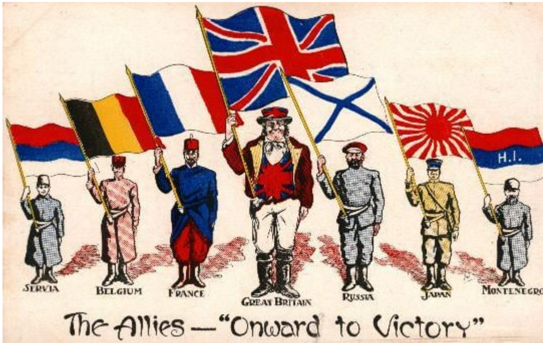
A postcard from 1916 showing national personifications of some of the Allies of World War I, each holding a national flag

Throughout the twentieth century the rise of globalism and neoliberalism led to a breakdown in nationalist ideology as the world became more and more economically interconnected leading some to believe that we had moved on to an era of postnationalism. However, postnationalism is an internationalistic process whereby power is partially transferred from national authorities to supranational entities like the European Union. Power is transferred from local elites to the super elite of the European Commission.