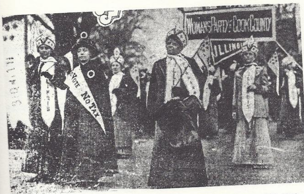
Wells-Barnett marching with other women suffragists in a parade in Washington, D.C., 1913

This fragile victory gained through the passage of the 15 th Amendment would be liquidated through the withdrawal of federal troops from the former Confederate states, the passage of Jim Crow legislation by southern state governments instituting peonage for African American farmers and the widespread usage of racial terror by white supremacist groups such as the Ku Klux Klan. Lynch law became the order of the closing decades of the 19 th century.