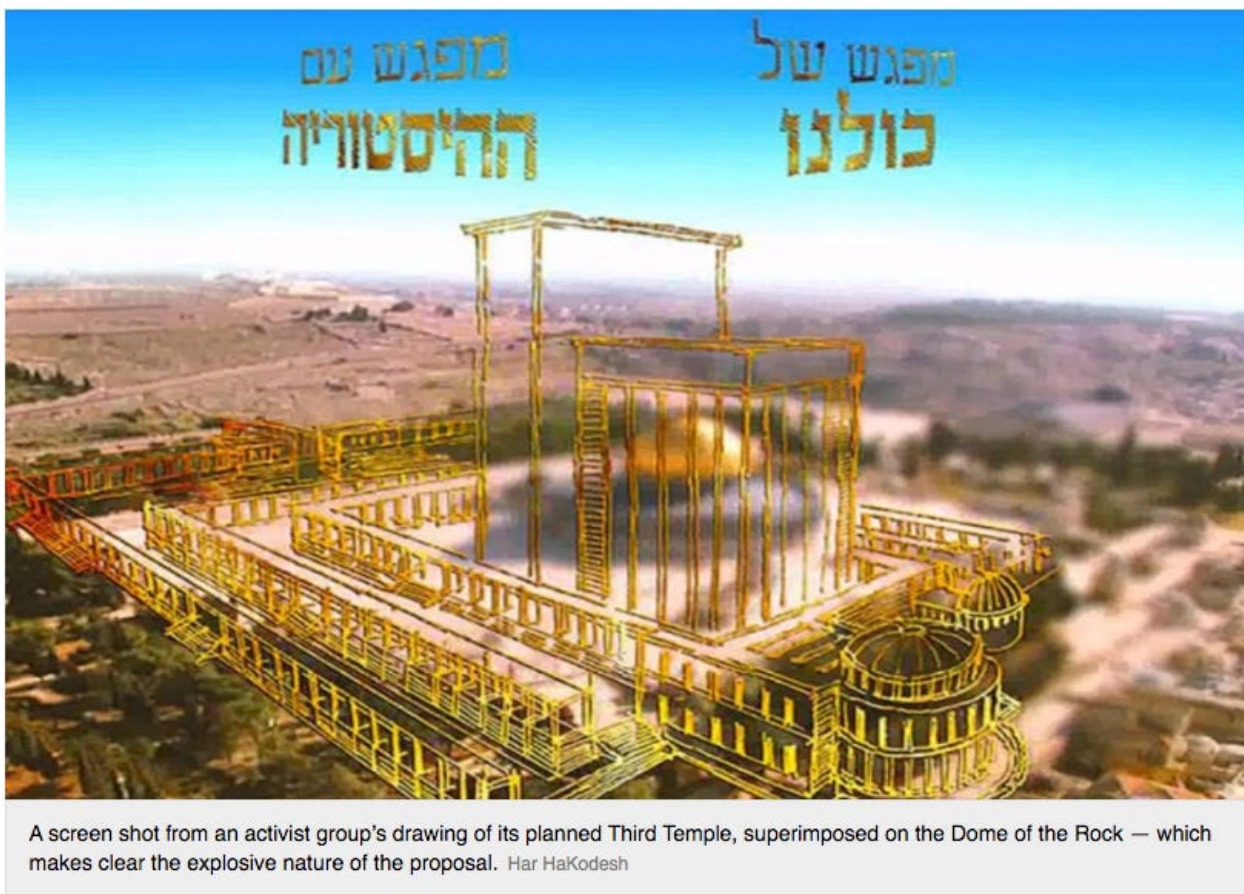
A screen shot from an activist group's drawing of its planned Third Temple, superimposed on the Dome of the Rock — which makes clear the explosive nature of the proposal. Har HaKodesh

The plan to replace the al-Aqsa mosque, which encompasses the Dome of the Rock, has explosive implications. The Dome of the Rock is the thousand-year-old structure that is the oldest in the Islamic world. The Rock under the Dome is where Prophet Muhammed is said to have communed with the spirits of Abraham, Moses, and Jesus before being transported to heaven. Many Islamic groups, including Hamas, have displayed uncompromising resistance to the assertion of Israeli jurisdiction over the site of the large compound of the al-Aqsa mosque. The mosque itself is built around the Dome of the Rock.