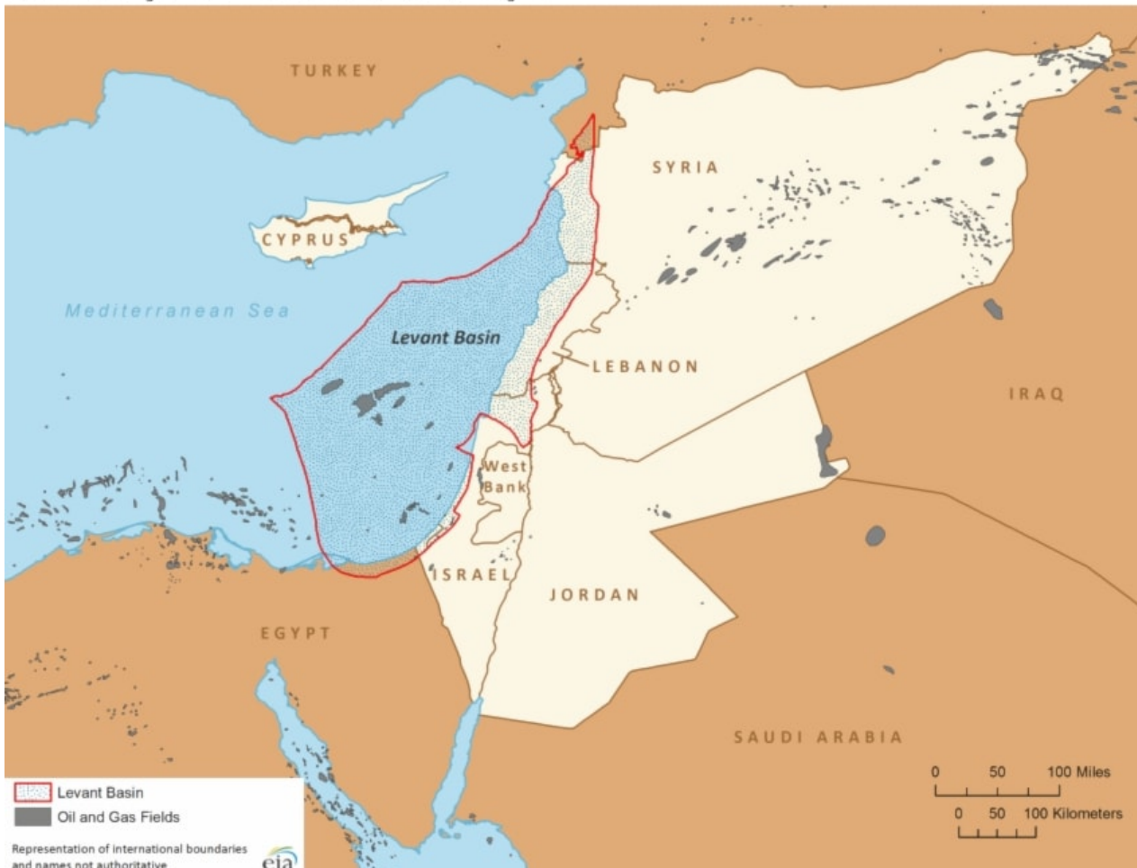
Oil and natural gas fields in the Eastern Mediterranean Region

Ultimately, Syria would not allow Western corporations to extract its gas, nor would Qatar's ambitious oil pipeline, meant to pass through Syria, ever materialize. Coincidentally, soon after, war broke out in Syria, with Qatar and "Israel" being two of many parties funding terrorist groups to try and overthrow Damascus.