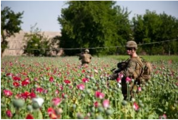
Image: U.S. troops guarding an opium poppy field in Afghanistan.

By 1984, Afghan heroin supplied a staggering 60 percent of the US market and 80 percent of the European market, while devastatingly creating 1.3 million heroin addicts in Pakistan, a country previously untouched by the highly-addictive drug.