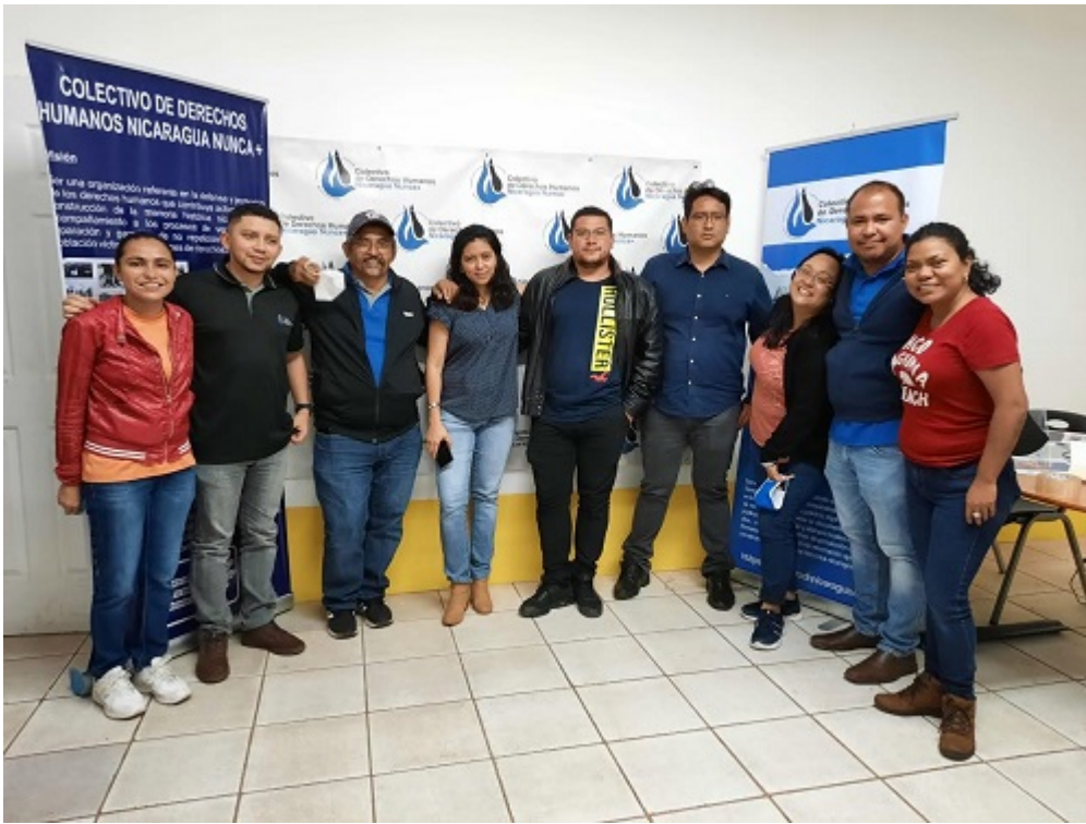
El Colectivo de Derechos Humanos Nicaragua Nunca Más as featured on NED website.

ANPDH reopened in Costa Rica and received more than $700,000 from USAID in 2020-2021. U.S. agencies such as the NED and USAID are still actively working with many organizations linked to Nicaragua, and the Open Society Foundation has just contracted a prominent opponent of the Sandinista government to administer a $25 million fund to promote women's political leadership .