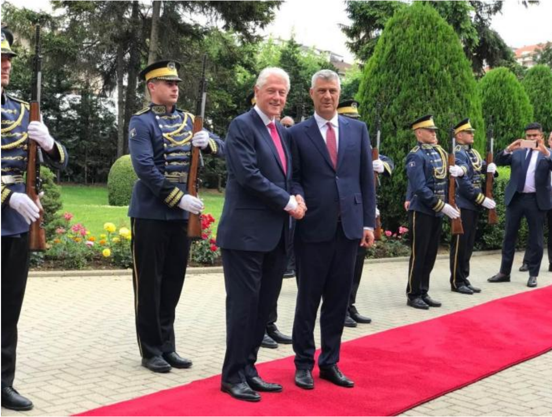
Former U.S. President Bill Clinton embraces Kosovo's President Hashim Thaçi after being given an award in Pristina in June 2019.

Four years later, Thaçi is no longer in power but a defendant at The Hague in the Netherlands at a special tribunal funded by the European Union. He stands accused of committing war crimes and crimes against humanity when he was a senior member of the Kosovo Liberation Army (KLA), including torturing and then ordering the execution of fellow Kosovo Albanians accused of being traitors and collaborators.