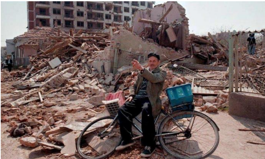
Wreckage from U.S.-NATO bombing in Kosovo in the spring of 1999.

With KLA assistance, American warplanes bombed Zastava automobile plant, a Serb government TV station, and the Chinese Embassy in the part that housed intelligence operatives, killing four, likely in an effort to intimidate the Chinese from using their veto over the UN Security Council (The official U.S. explanation was that it was using an “old map” of the city). [8]